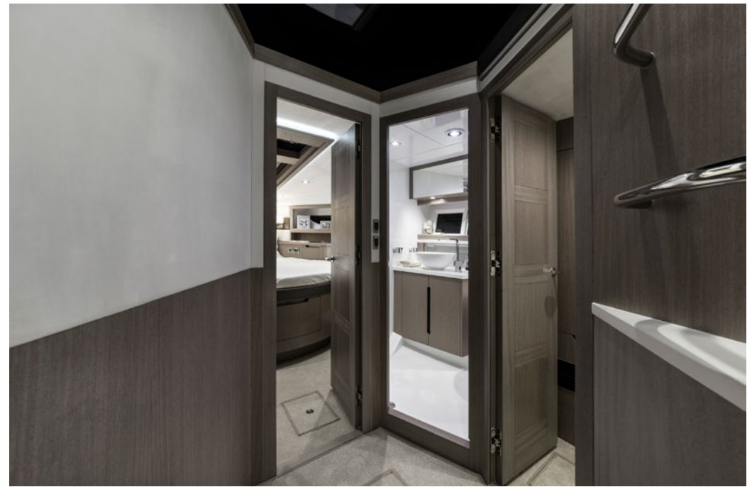
Two bedrooms await the guests —