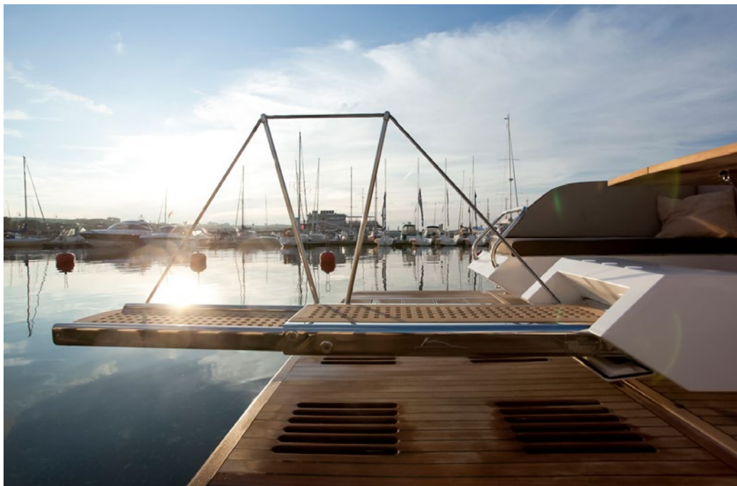
— The optional passerelle for easier access