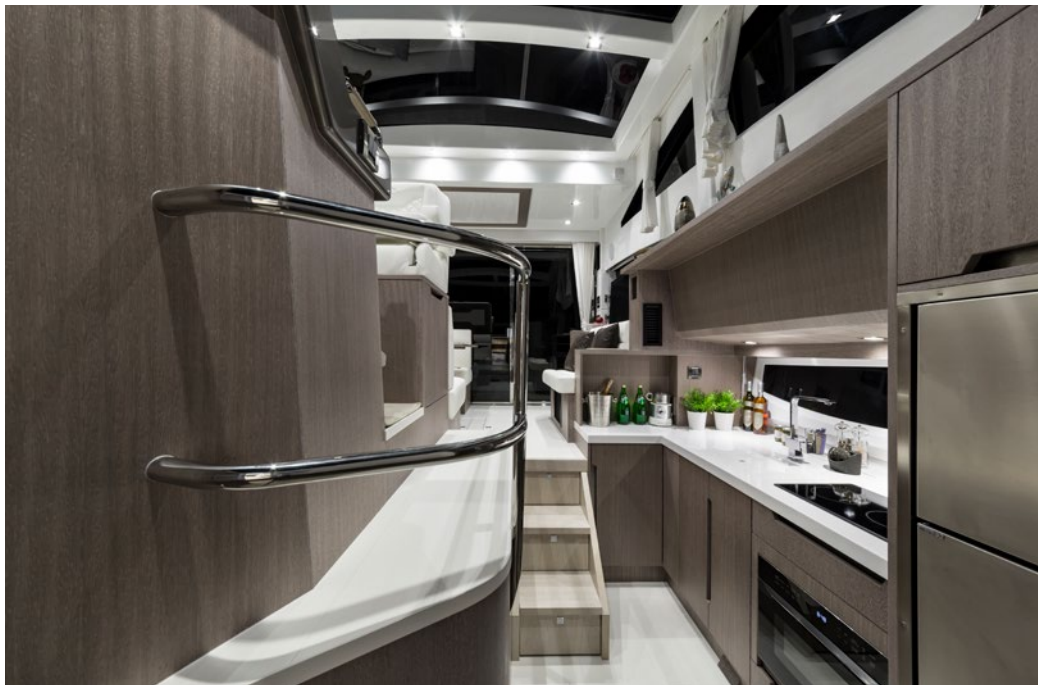
The galley can take place of one of the cabins —