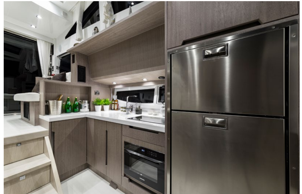
In the two cabin version the galley is moved down below —