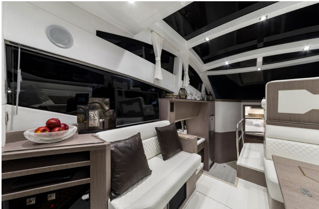
Rest area opposite the dinette —