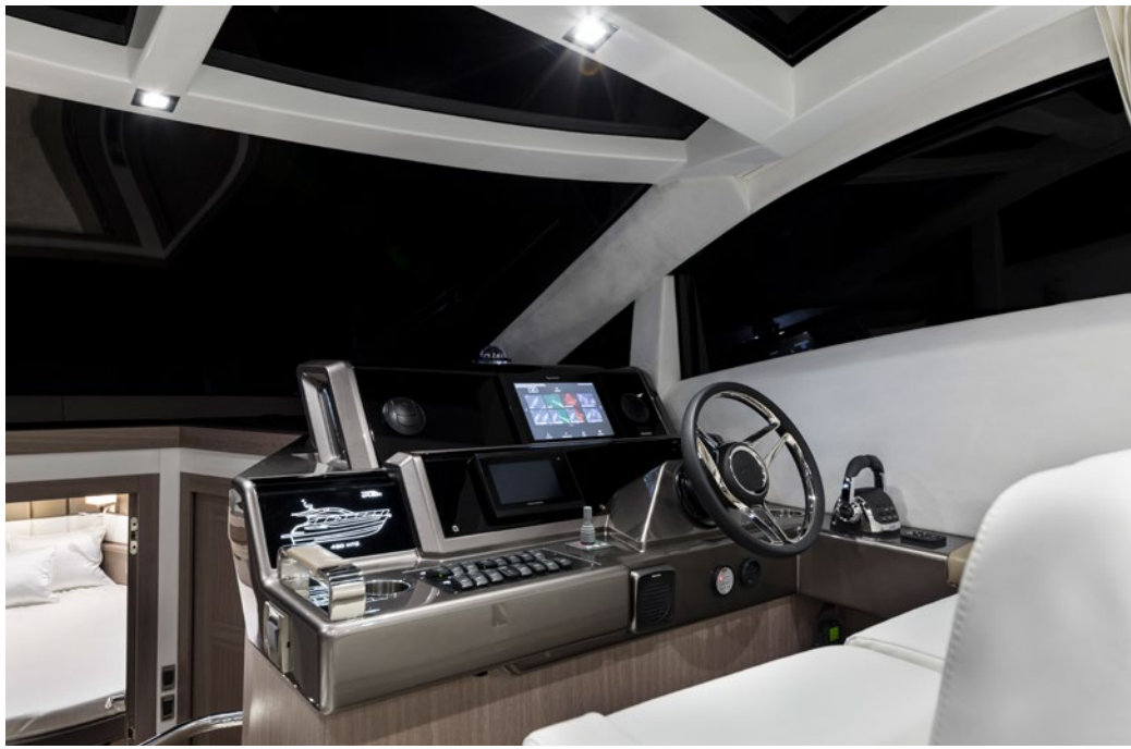
The helm station to control the yacht —