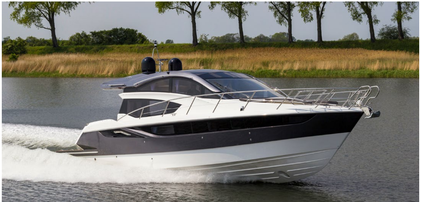
Great design and performance of the 430 hardtop

The 430 HTC offers a dynamic exterior with a large glass sunroof over the helm