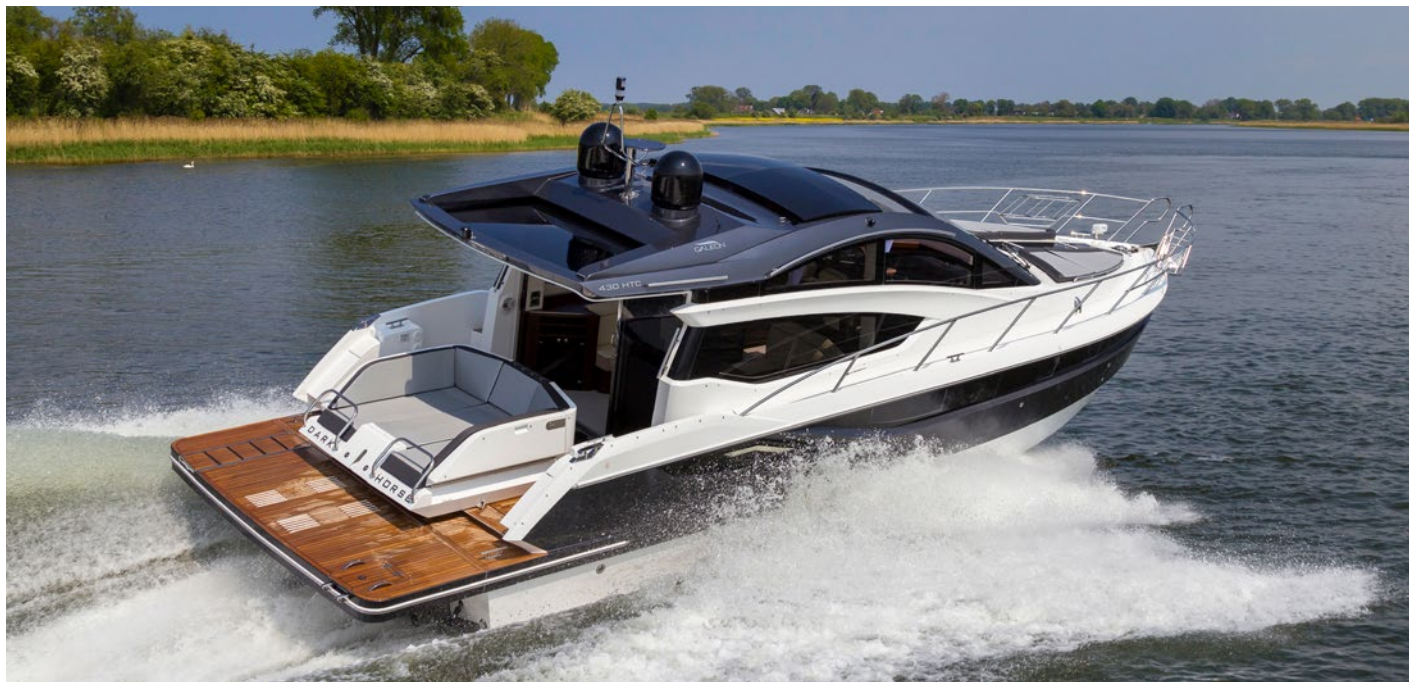
A transformable cockpit area