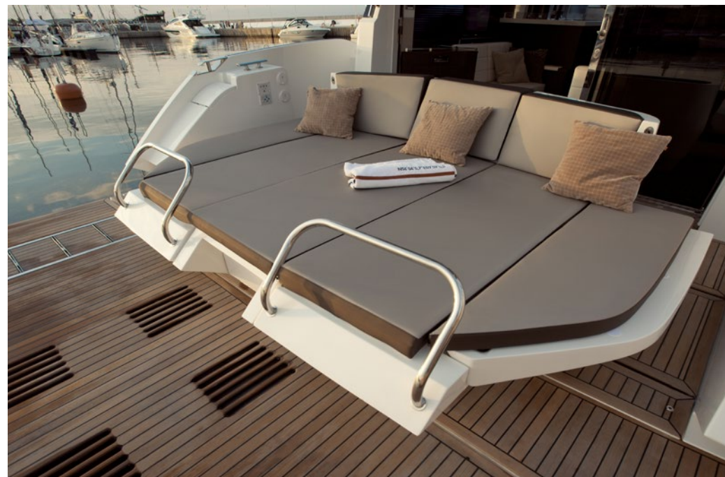
— Extend the sundeck if needed