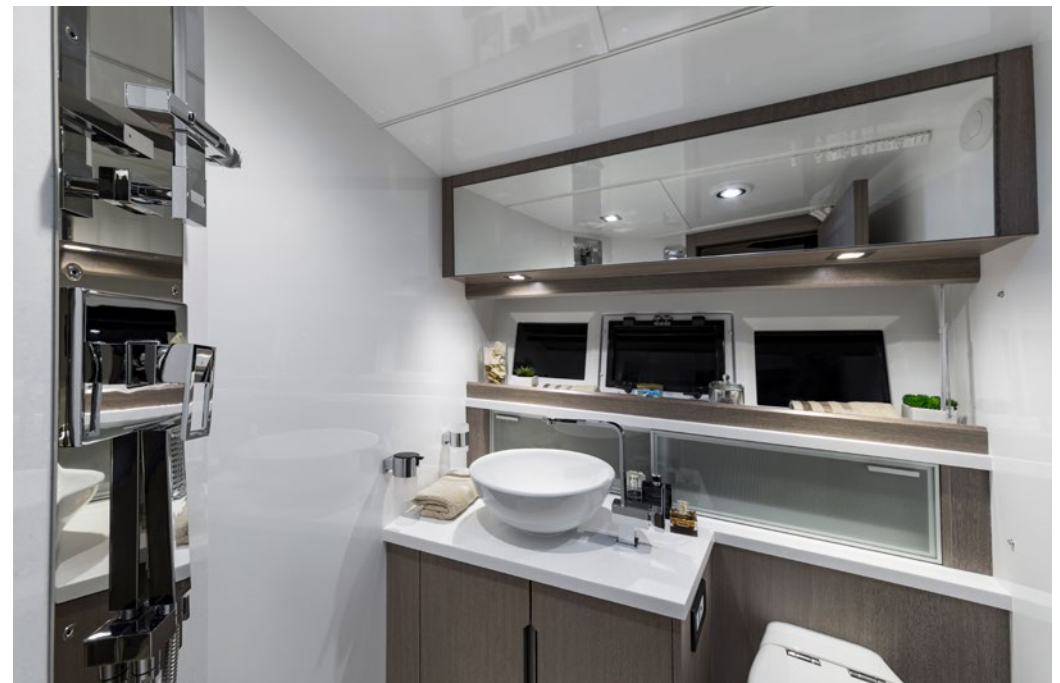
Bathroom with shower down below —