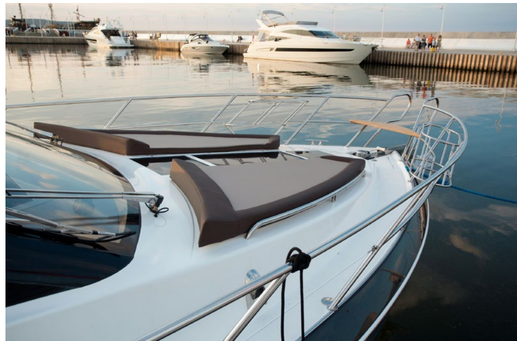
— Bow sundecks