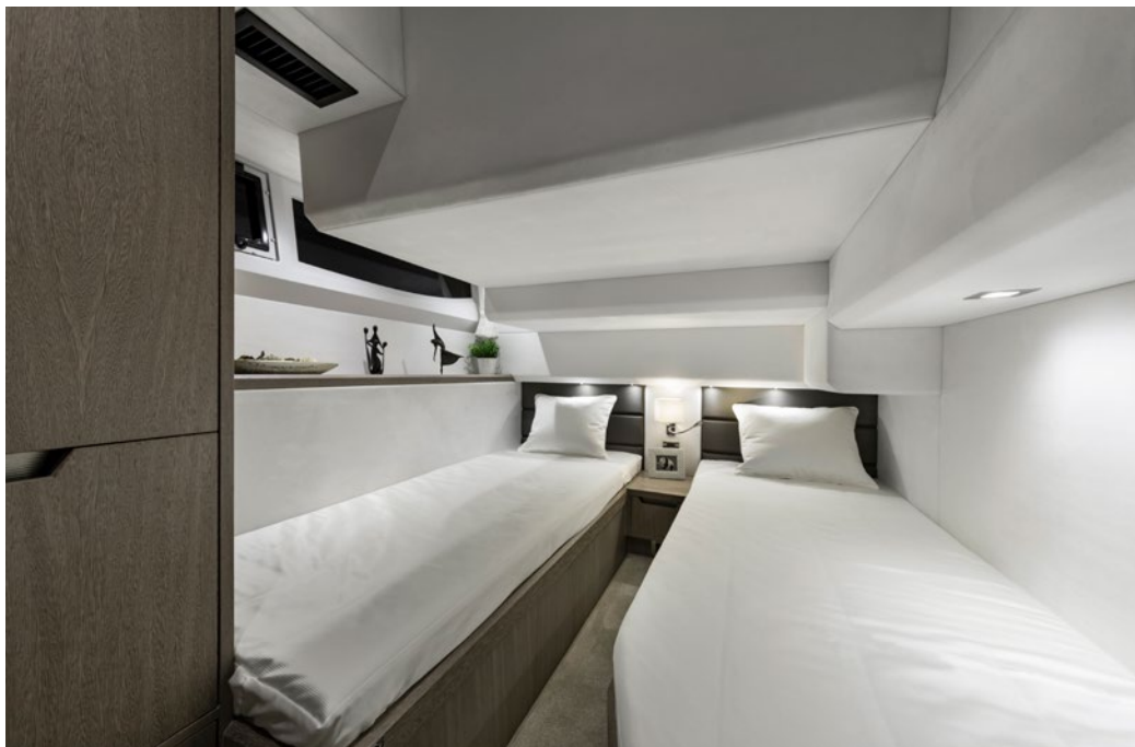
Twin guest bedroom —