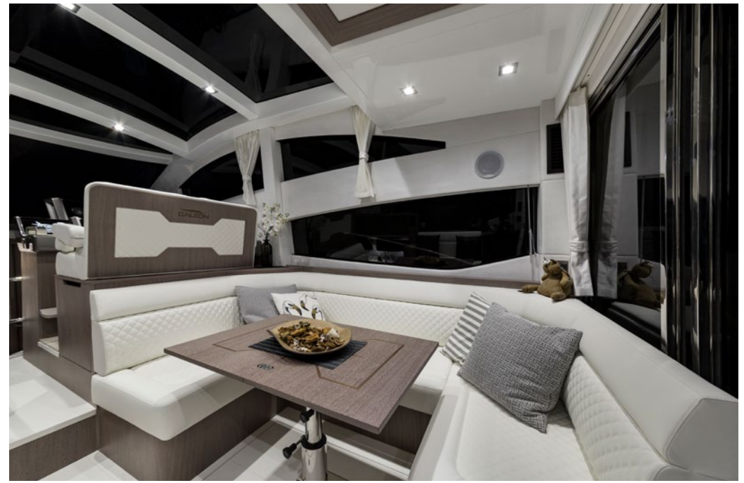
Dinette moved back —