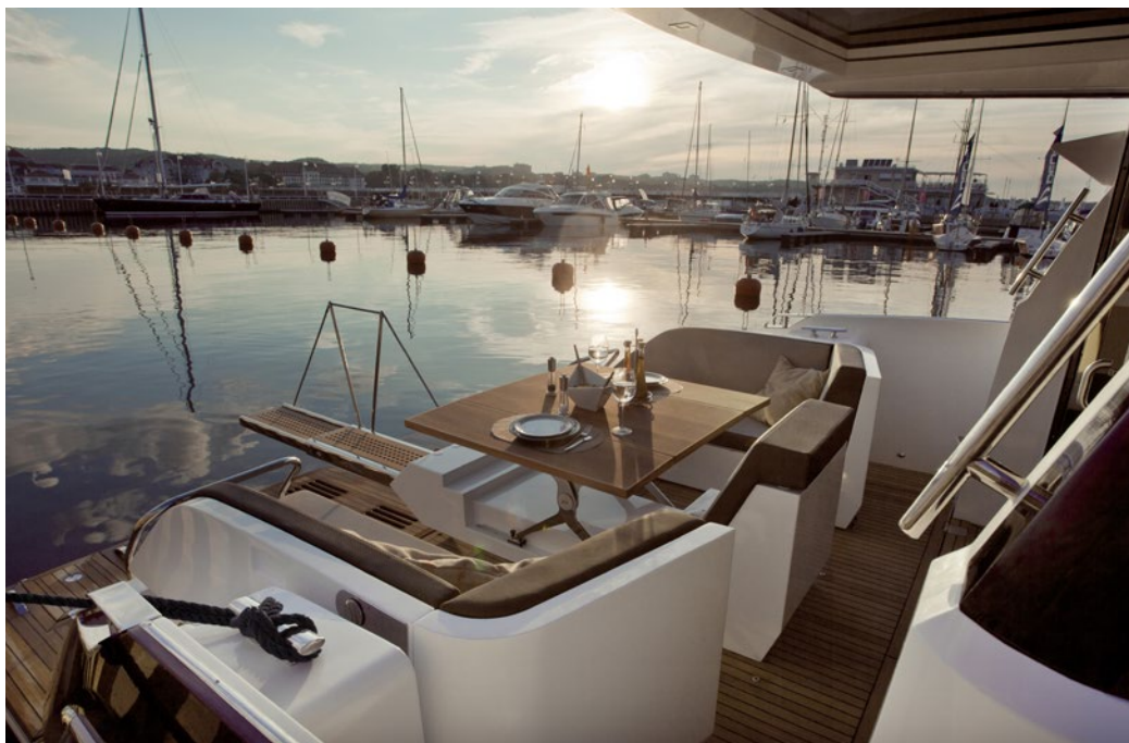
— Cockpit in dining mode with the pop-up table