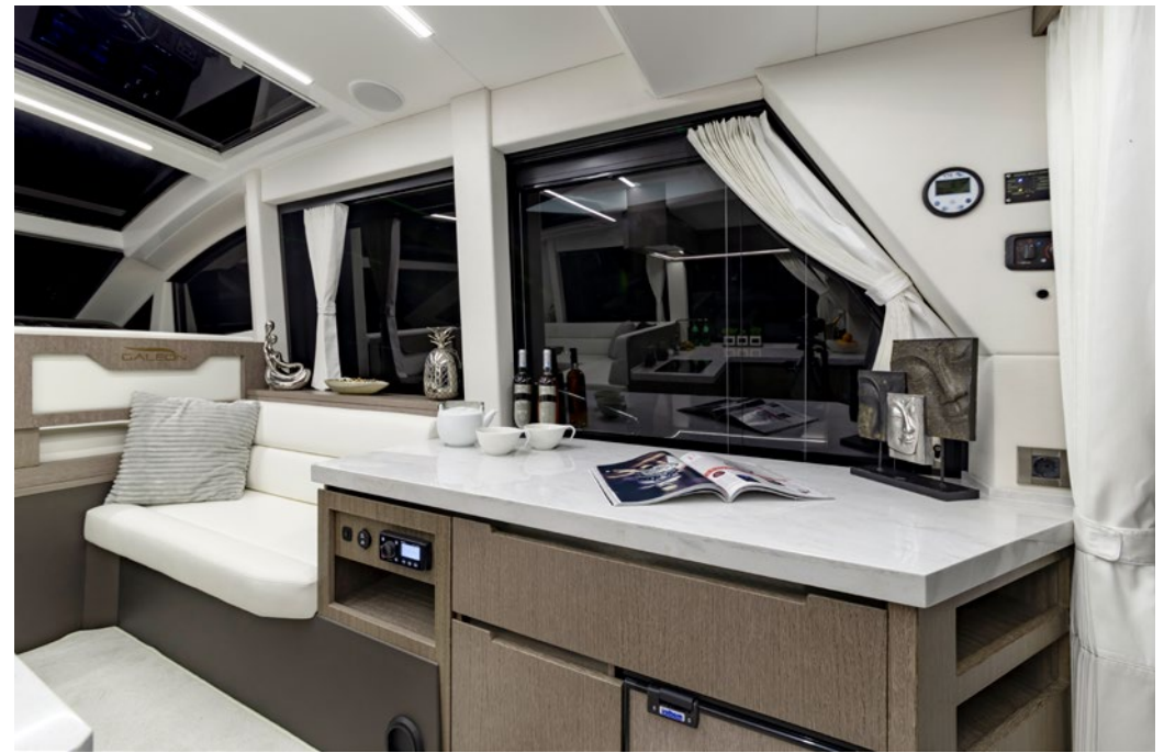
The large windows slide forward opening up the interior!