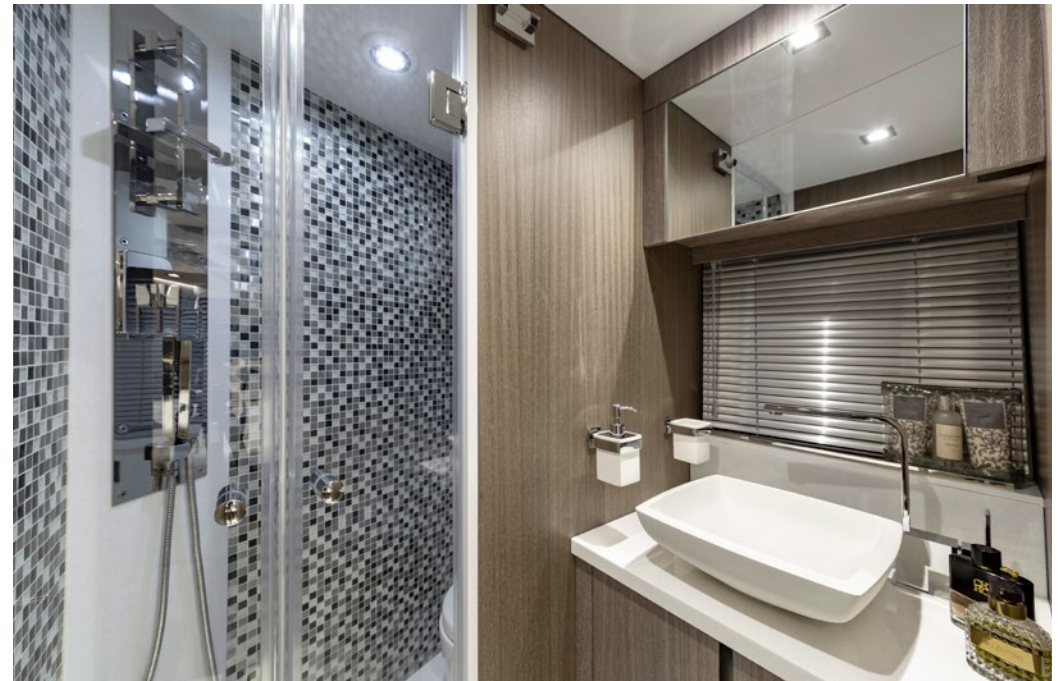
Two bathrooms are located below deck —