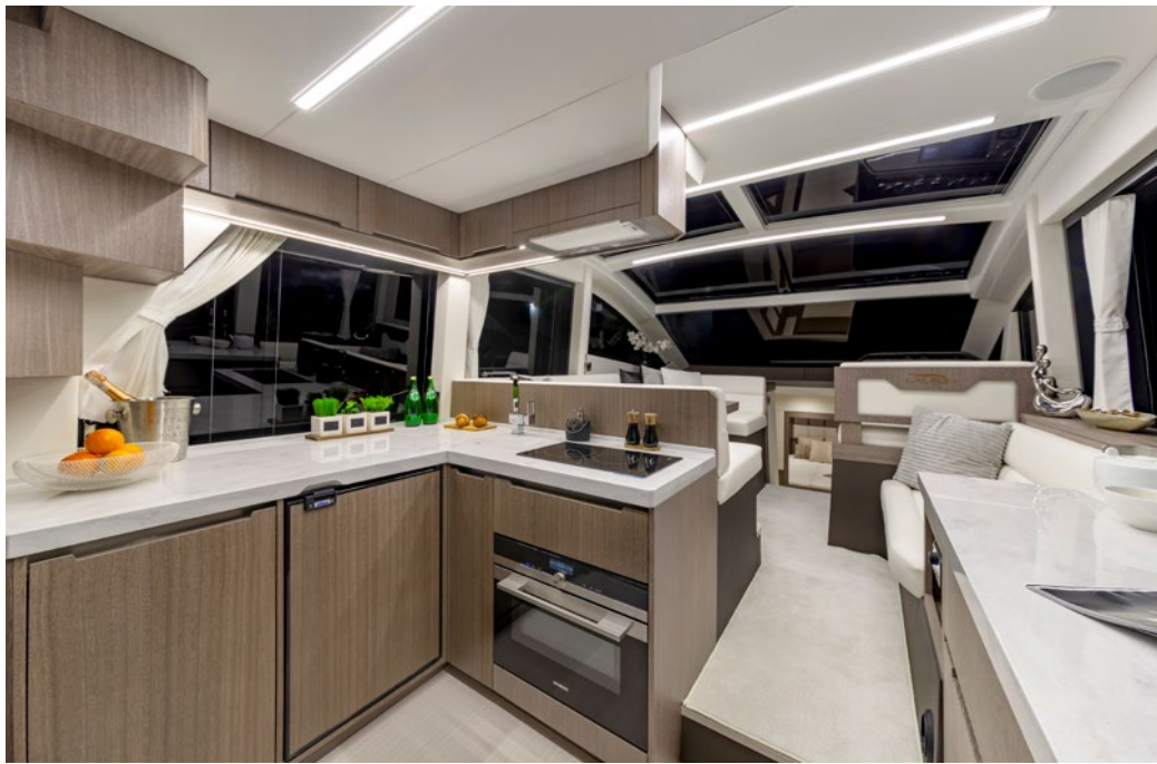
A well equipped galley is moved back