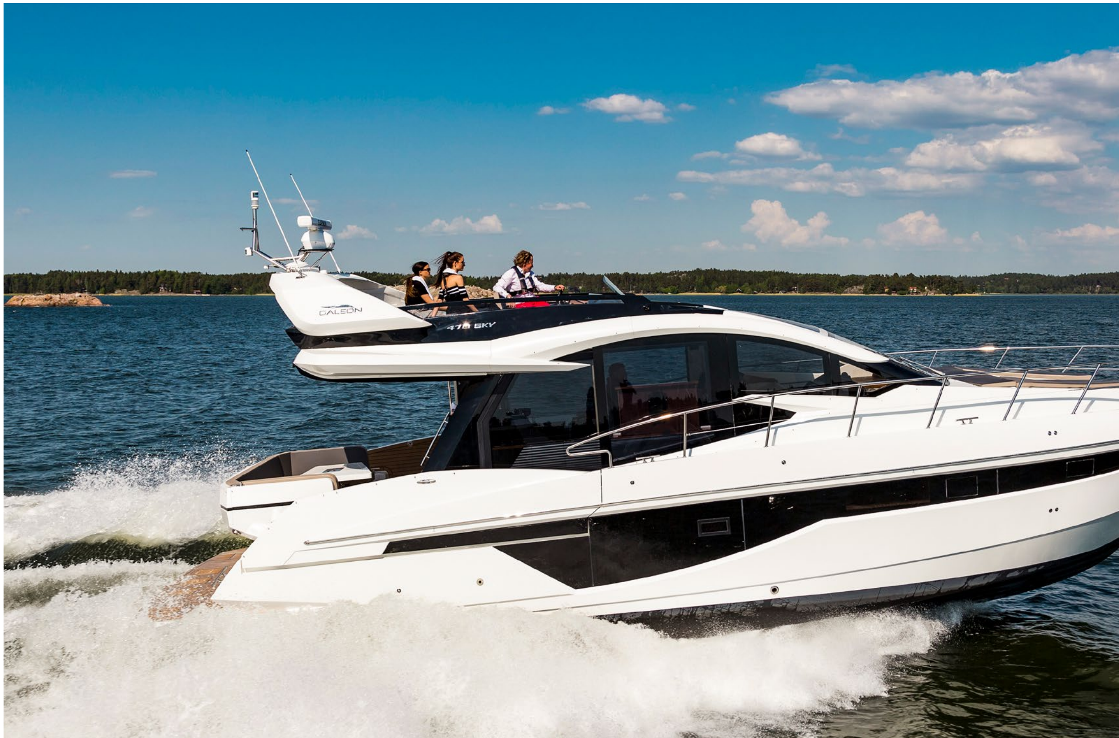
— Notice the sporty line of the Skydeck and a high volume of windows