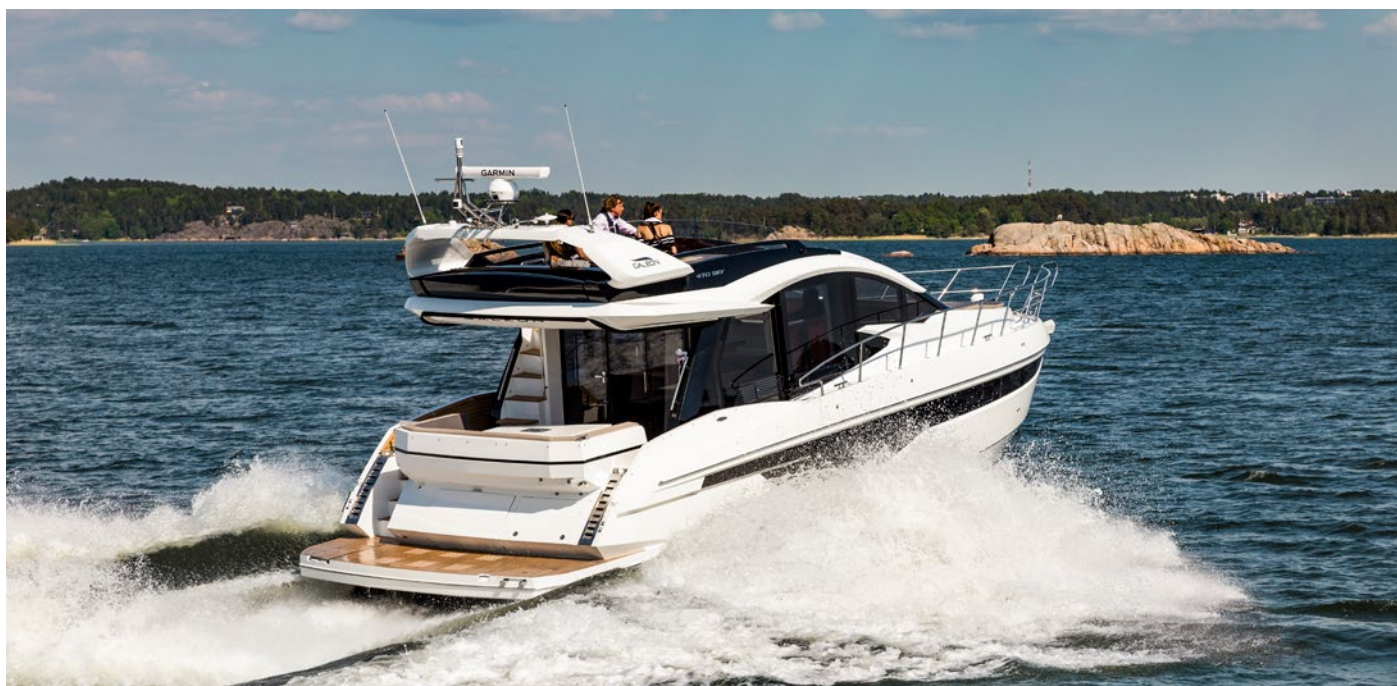
Various cockpit options are available including a roto-seat