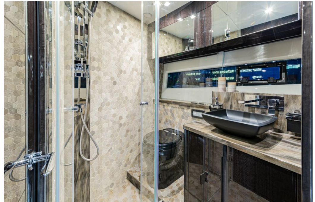
— The bathroom includes high quality accessories