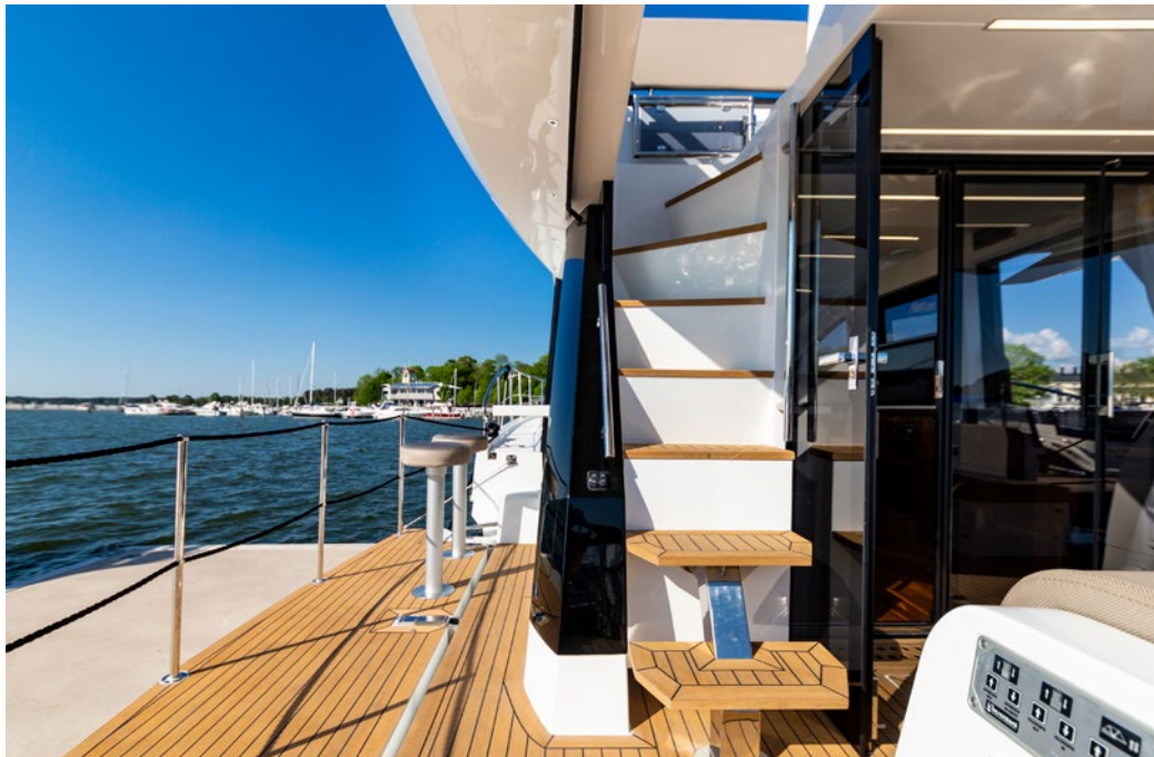
— Beach Mode and easy access to the top deck