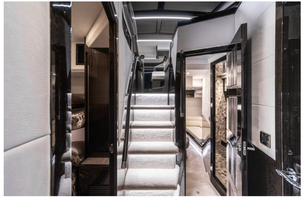
— The interior reflect the level of detail precision