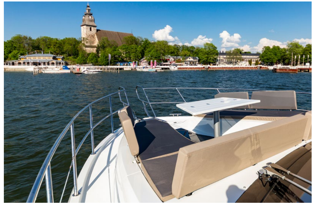
— Prop-up table in the bow rest area