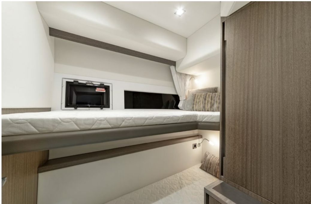
Bunk beds in the guest bedroom —