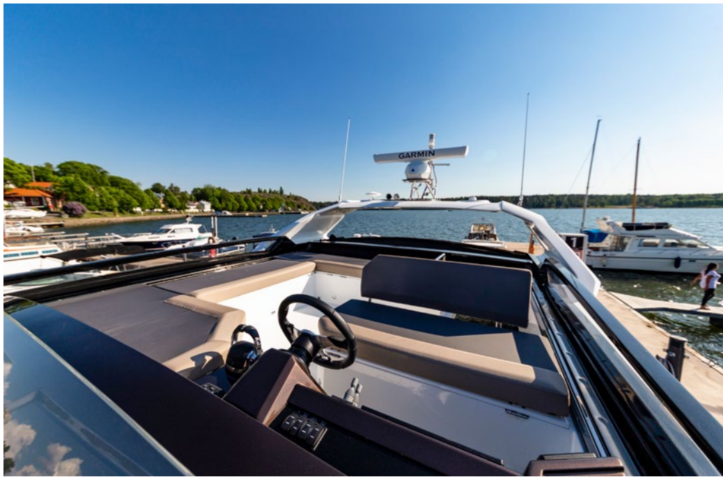
— Quickly close off the top deck when not in use - genius!