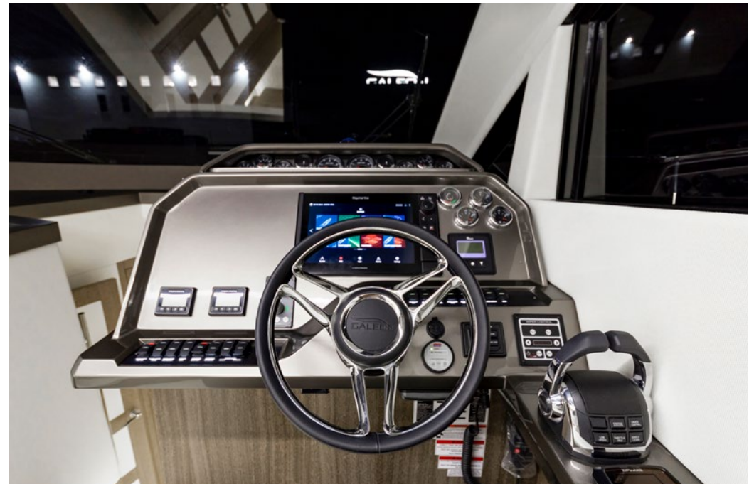
Take control of the yacht from the helm on the main deck