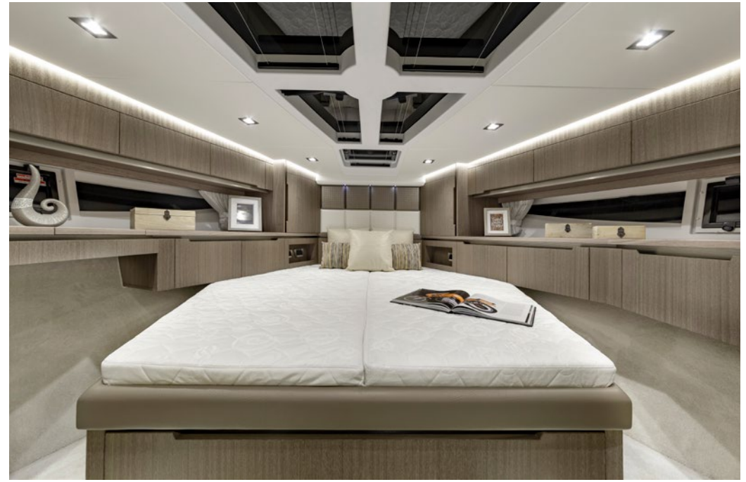
The forward VIP cabin with skylights above —