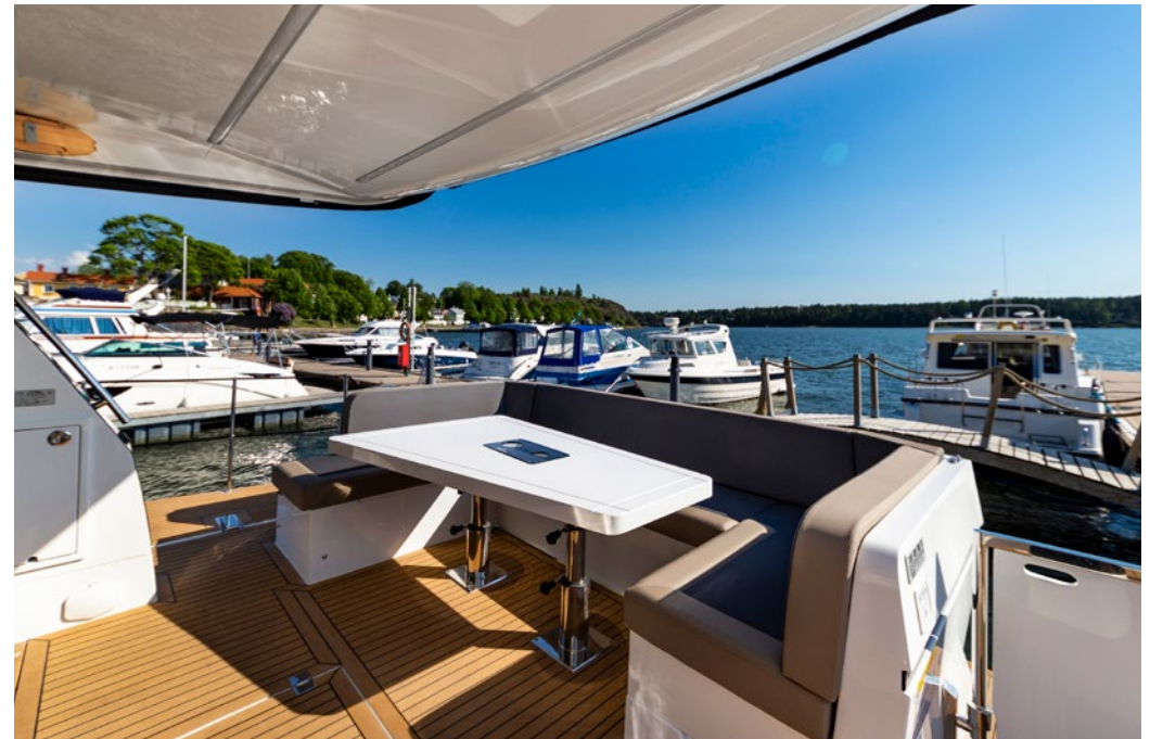
— A large cockpit can also fit a 360° rotating sofa