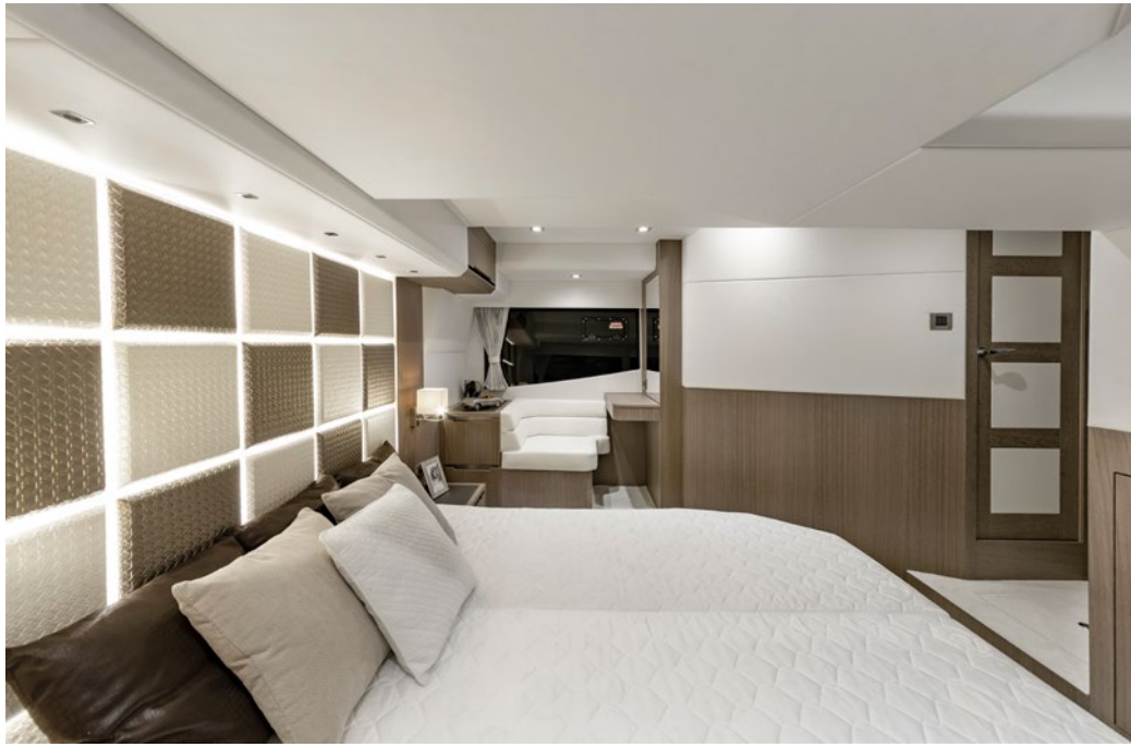
The owner's cabin offers a private bathroom for comfort —