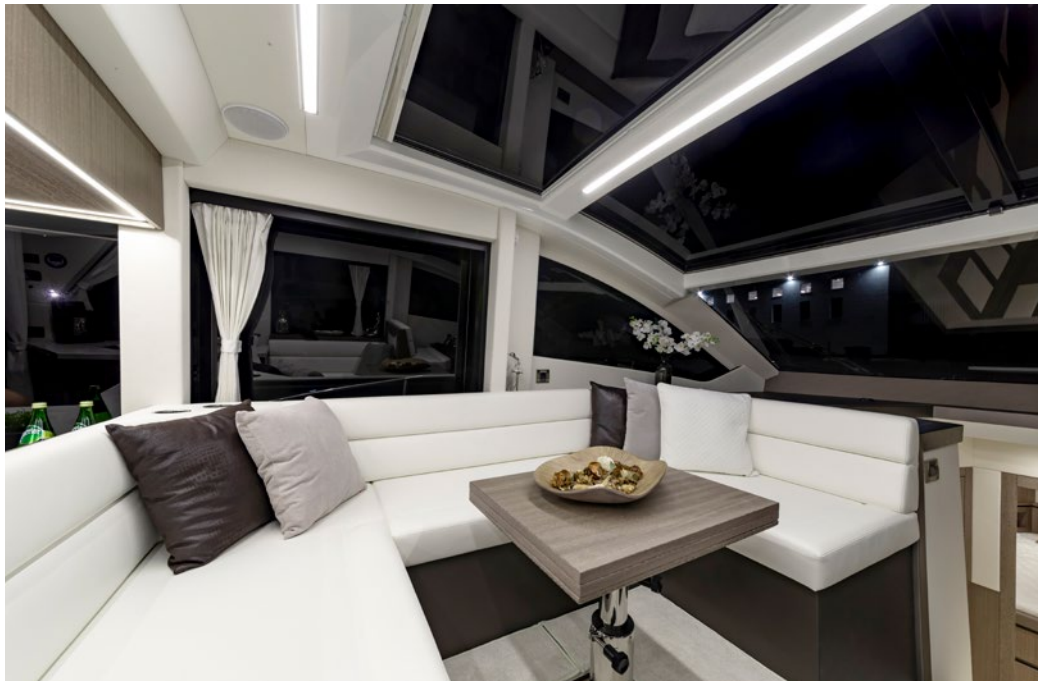
The dinette and rest area, notice the large sunroof above