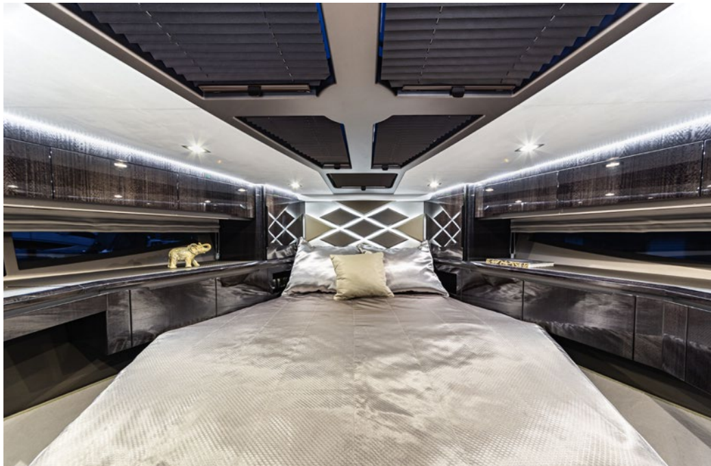
— The spacious bow cabin offers plenty of storage space