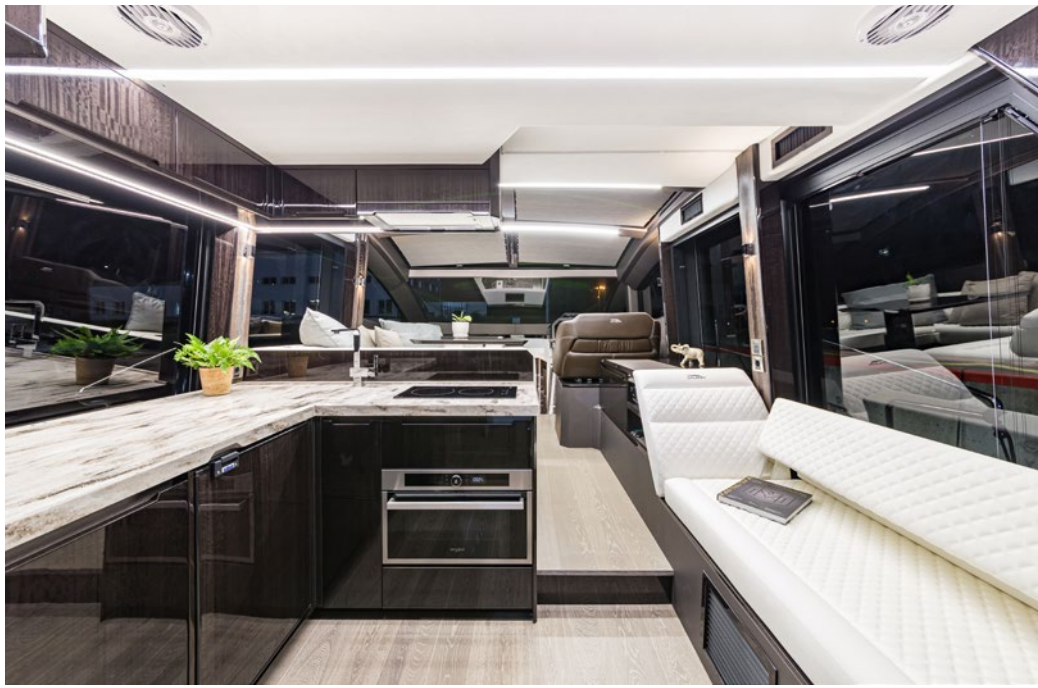
— The huge windows offer extraordinary views more typically associated with a larger yacht