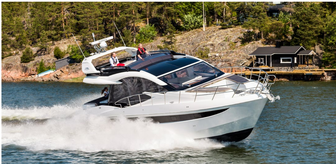
Great handling of the sport-oriented 470 model