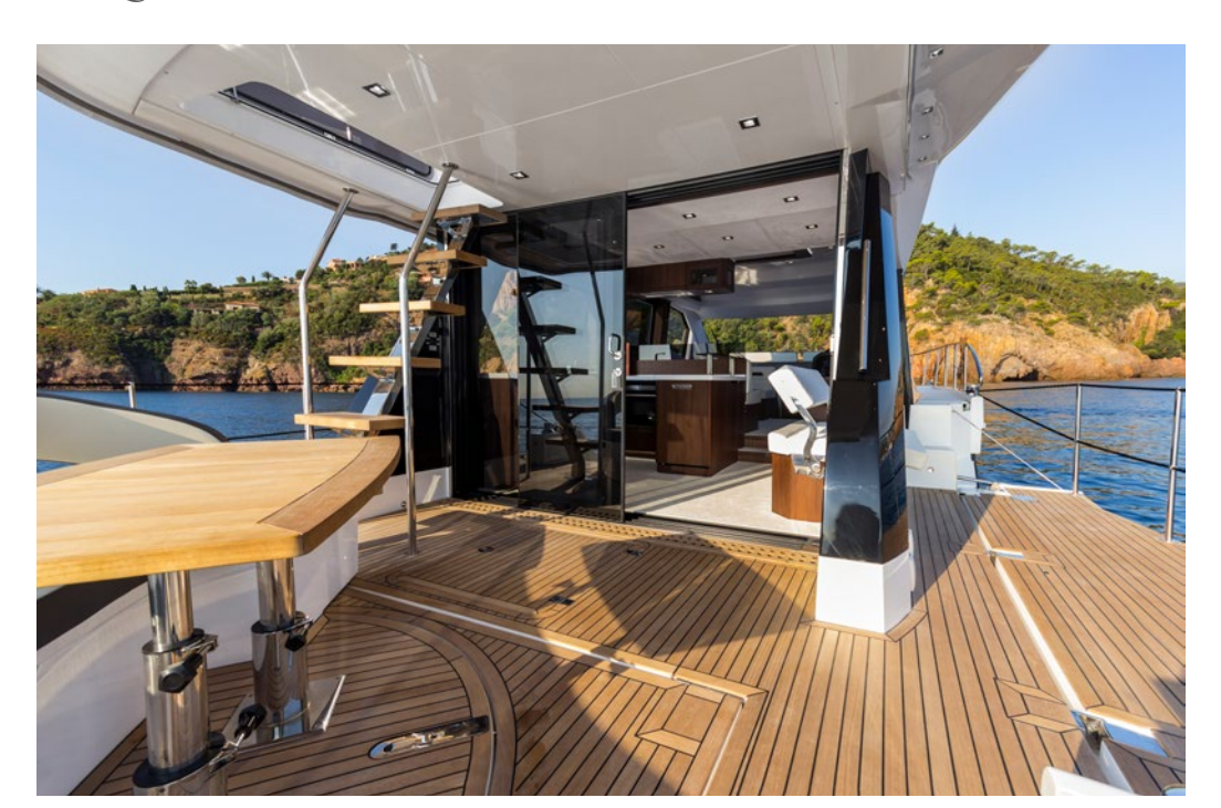
Drop down the sides and enjoy the incredible cockpit area