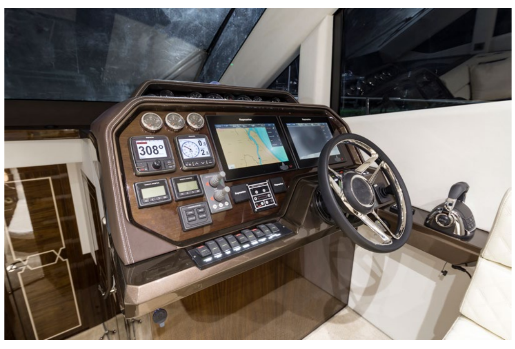
The helm can be fitted with a variety of navigational equipment