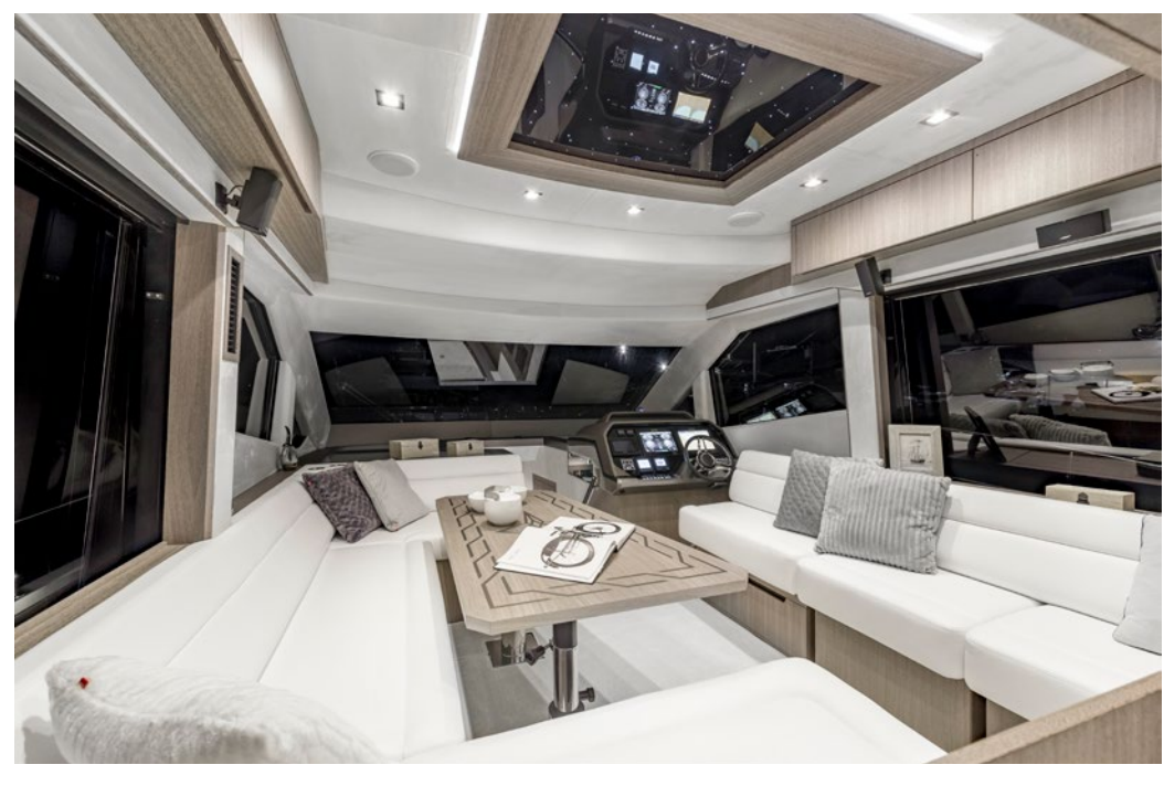
The entertainment area with a pop-up TV —