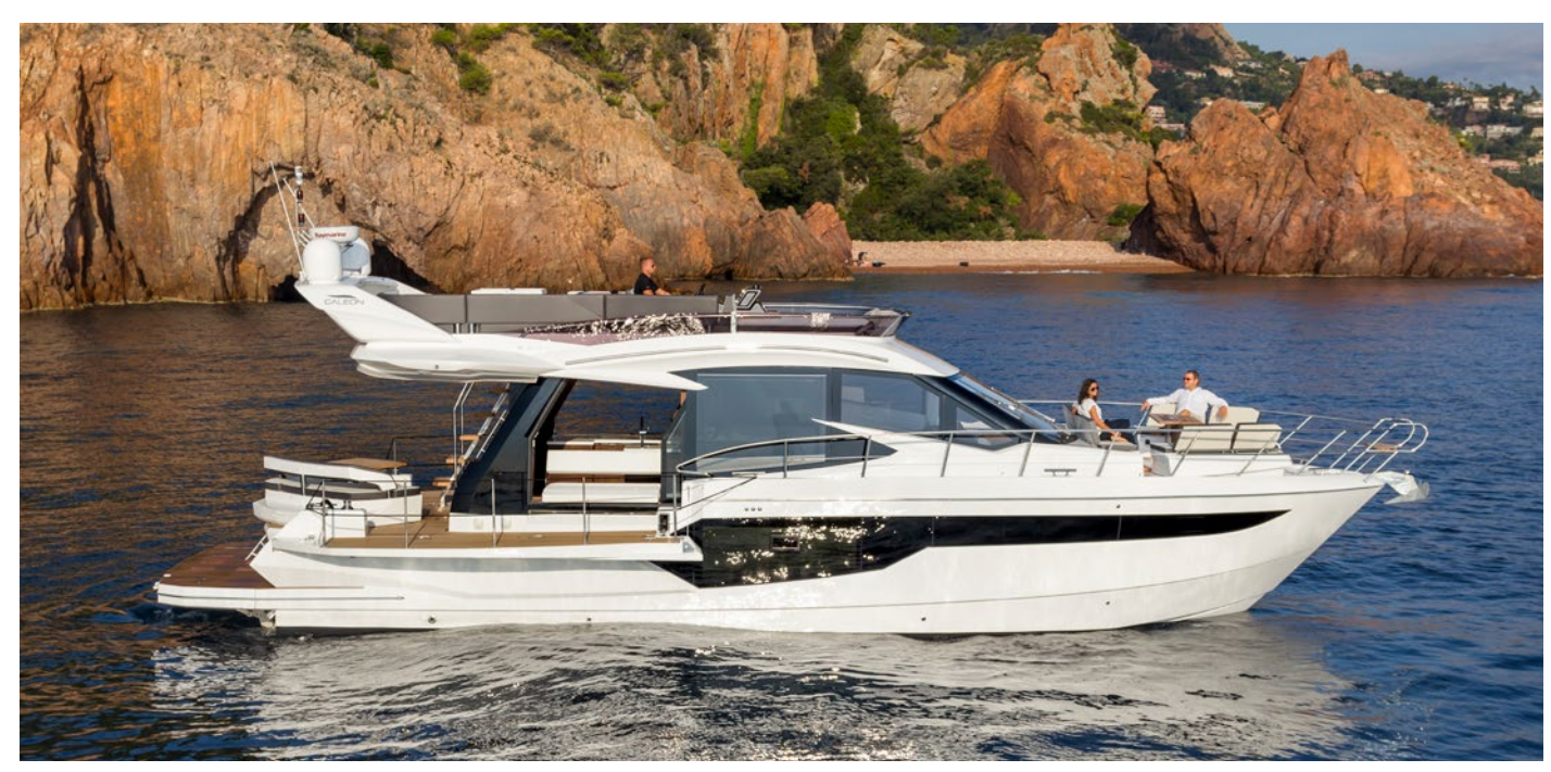
Find an amazing variety of leisure space all around the yacht