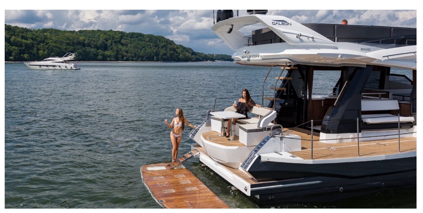
Make sure to take full advantage of the options available