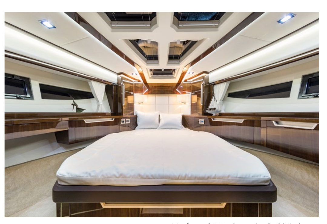
The forward VIP cabin with a double bed