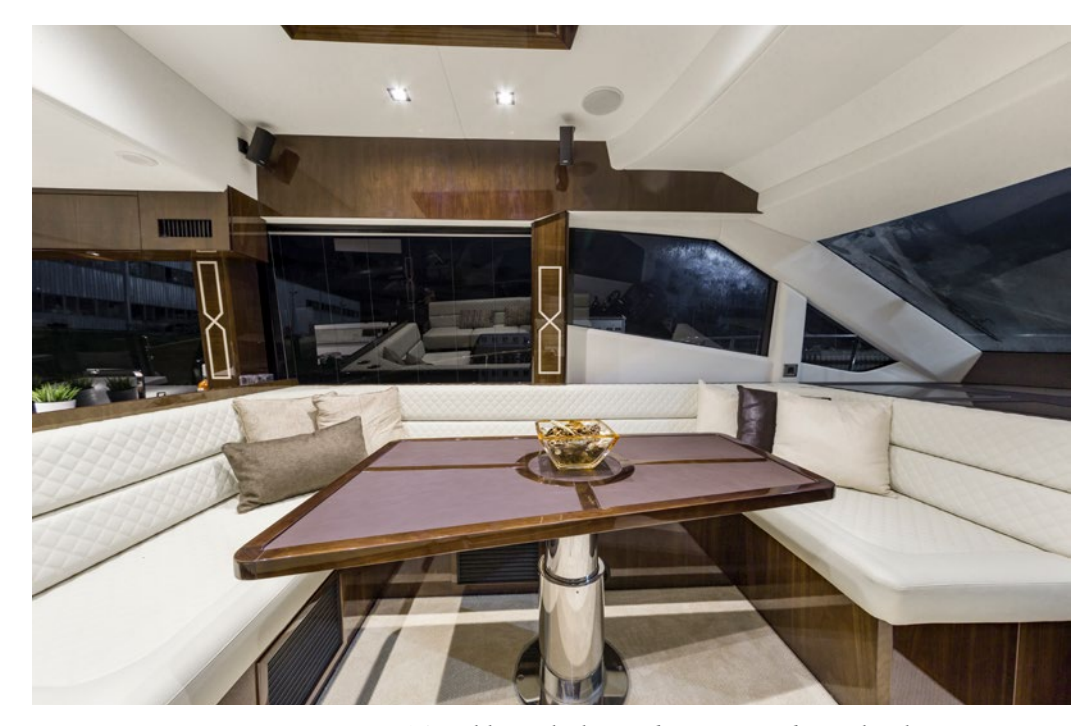
The table can be lowered to create and extra berth – smart!