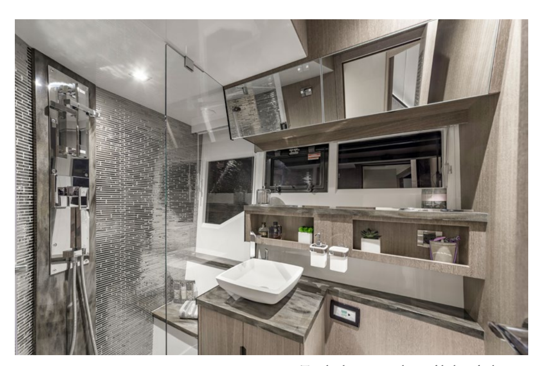
Two bathrooms are located below deck