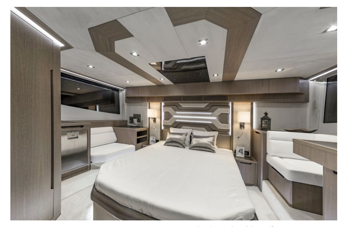
The owner's cabin located midship offers great space —