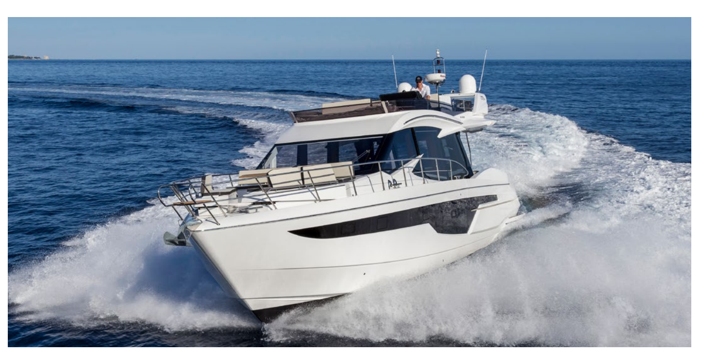
Supreme handling and performance