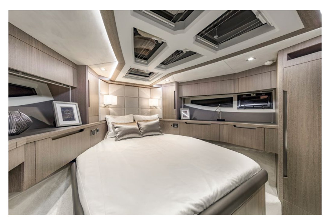
Forward VIP cabin is brightened by a series of skylights —