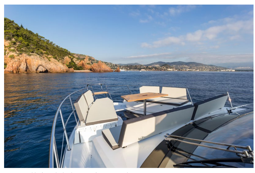
Quickly drop the back rests and stow away the seats – smart!