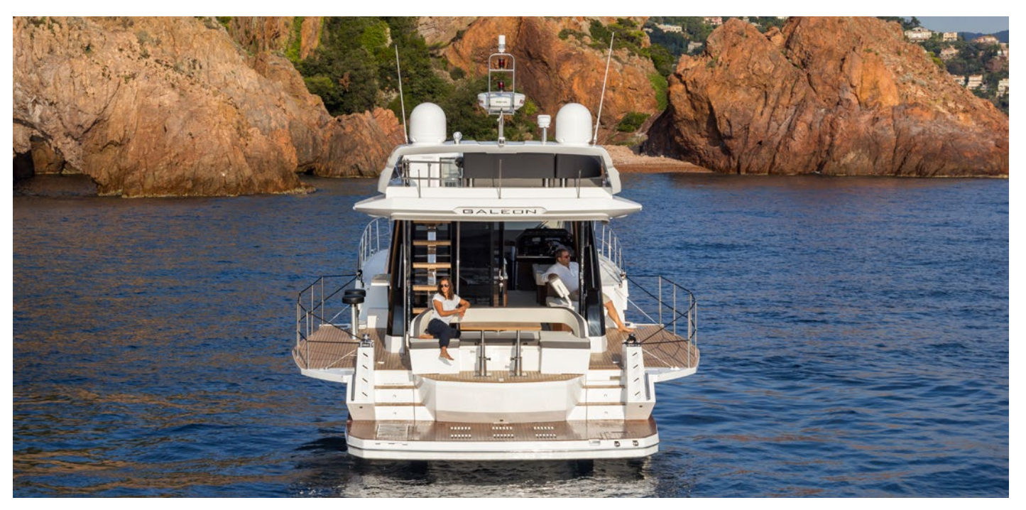
Beach Mode with a roto-seat facing aft – spectacular!