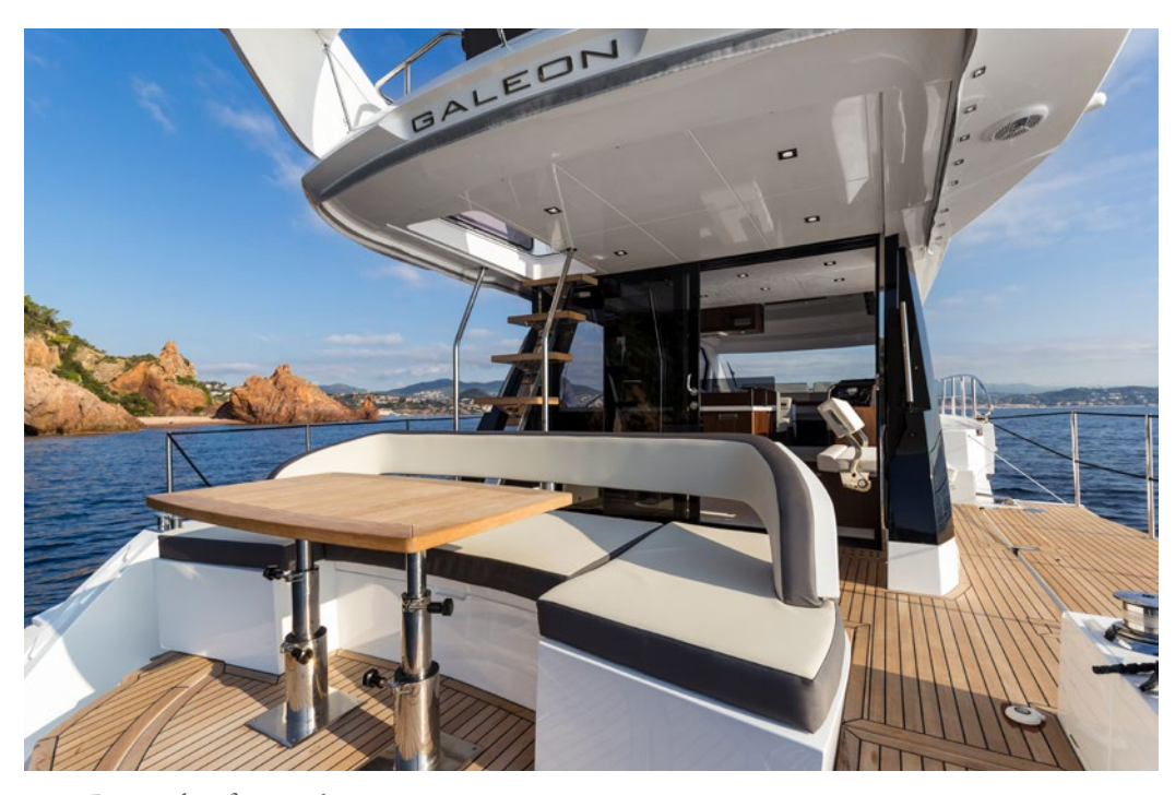
Rotate the aft seat 360°