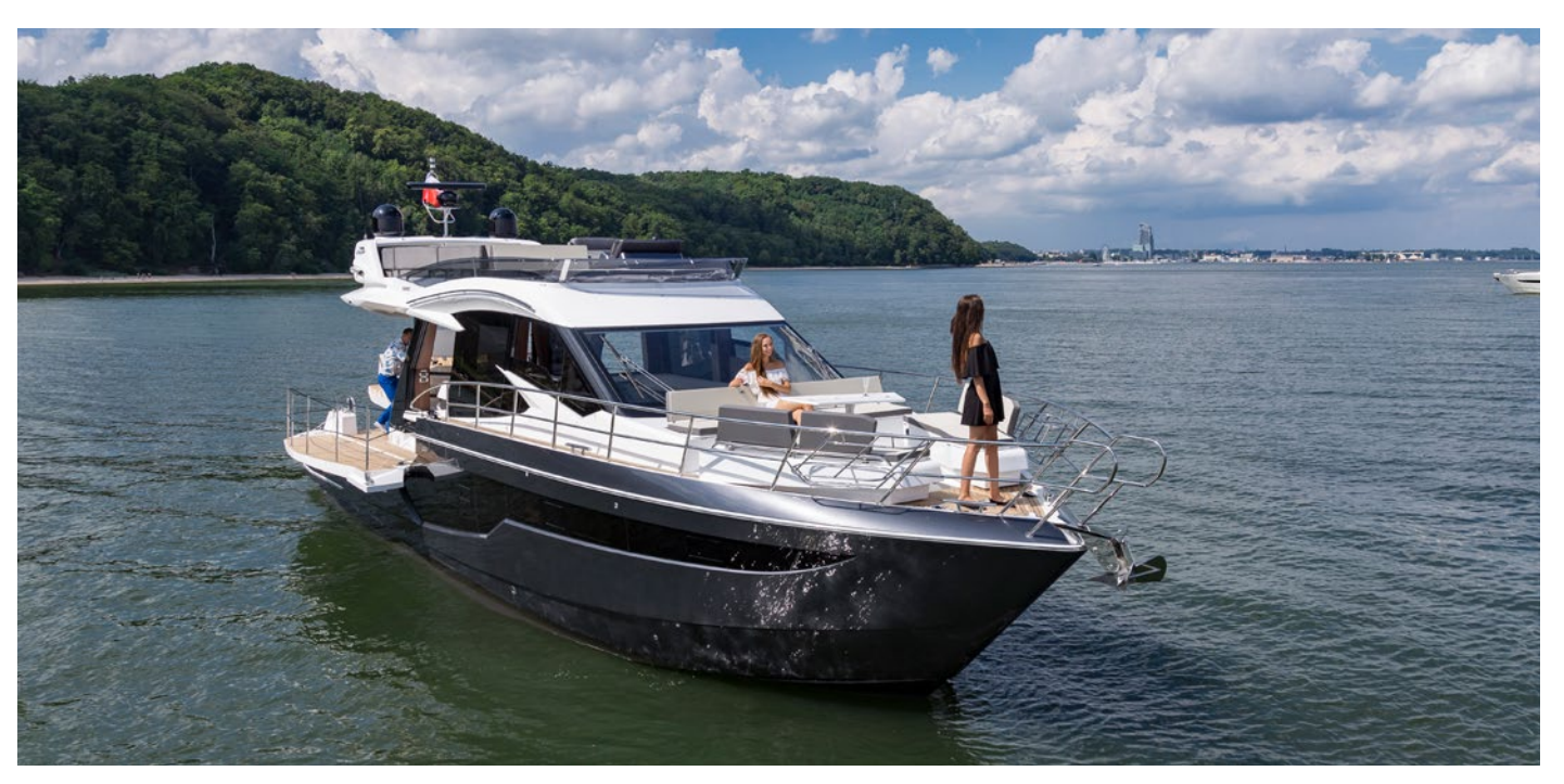
Enjoy your time on the bow where the rest and leisure area awaits