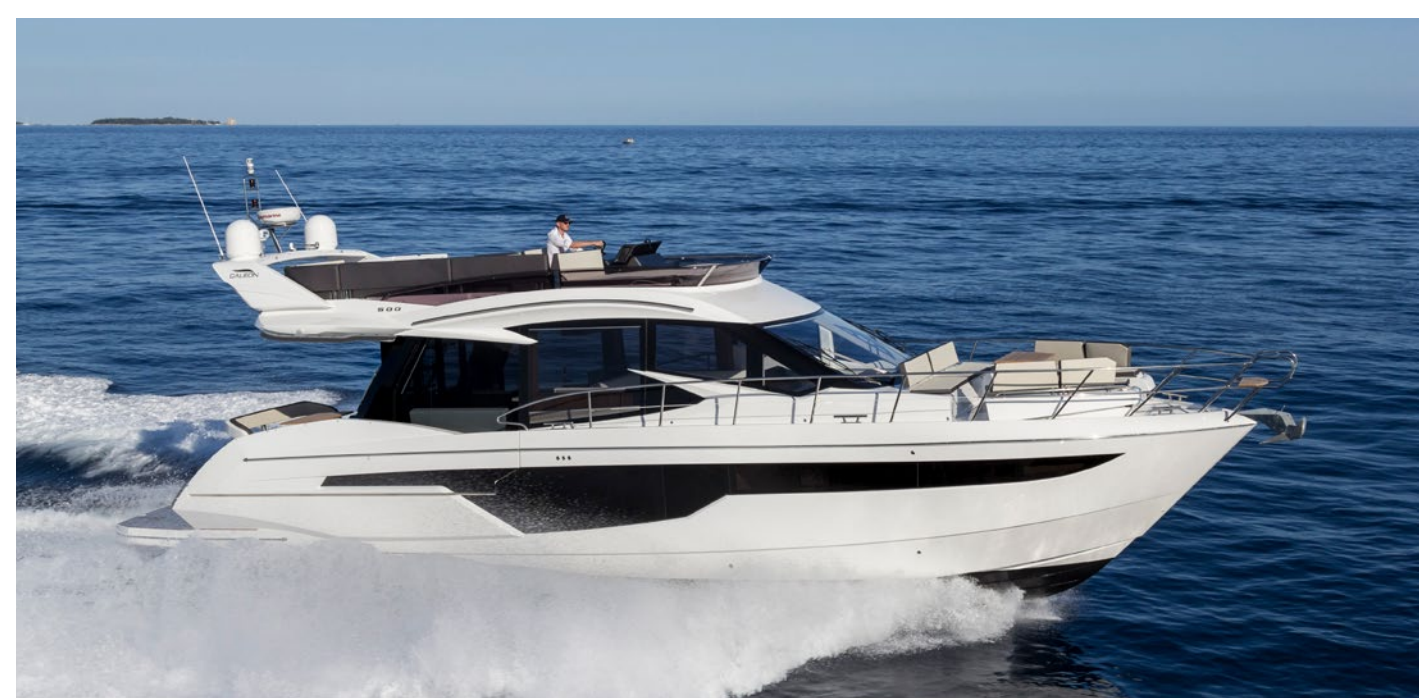
The stunning exterior of the 500 FLY —