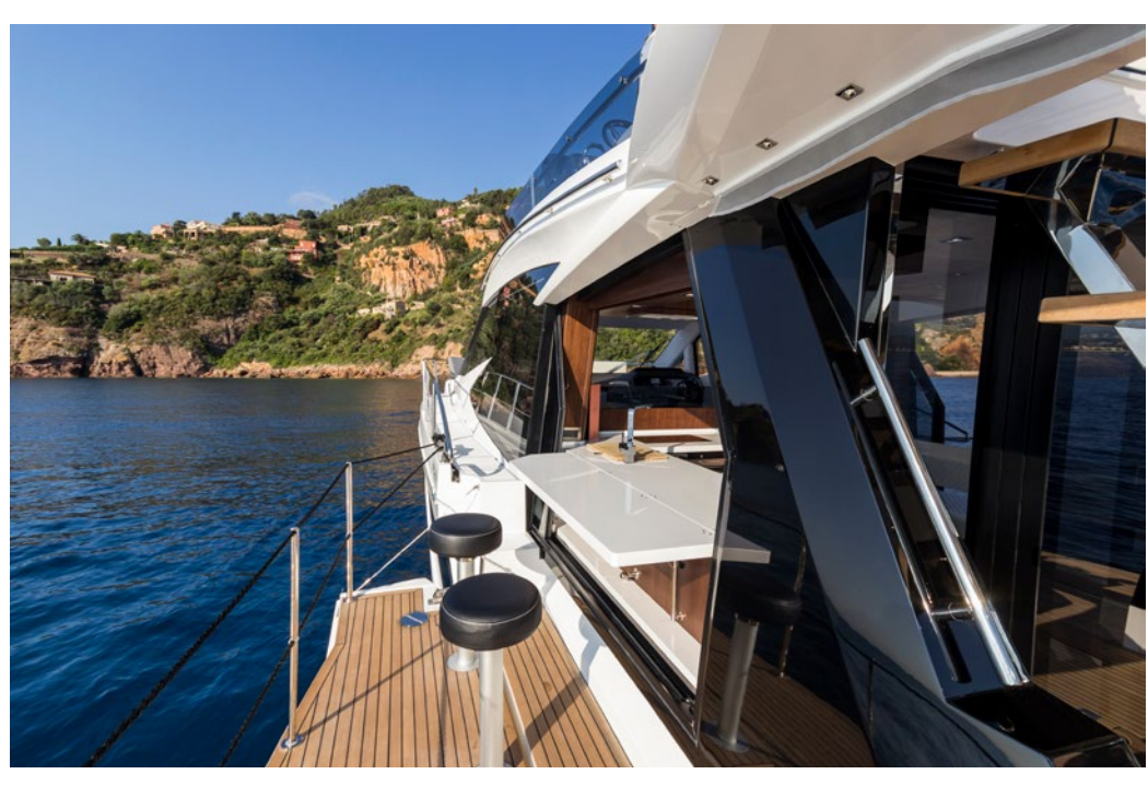
Serve drinks outside and impress your guests