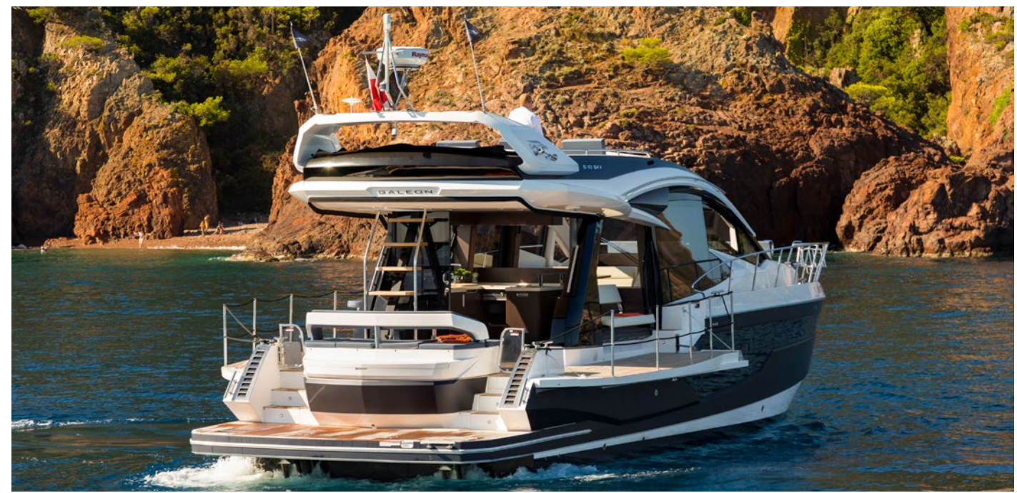
Find a bath platform, a roto-seat and a compact garage at the aft