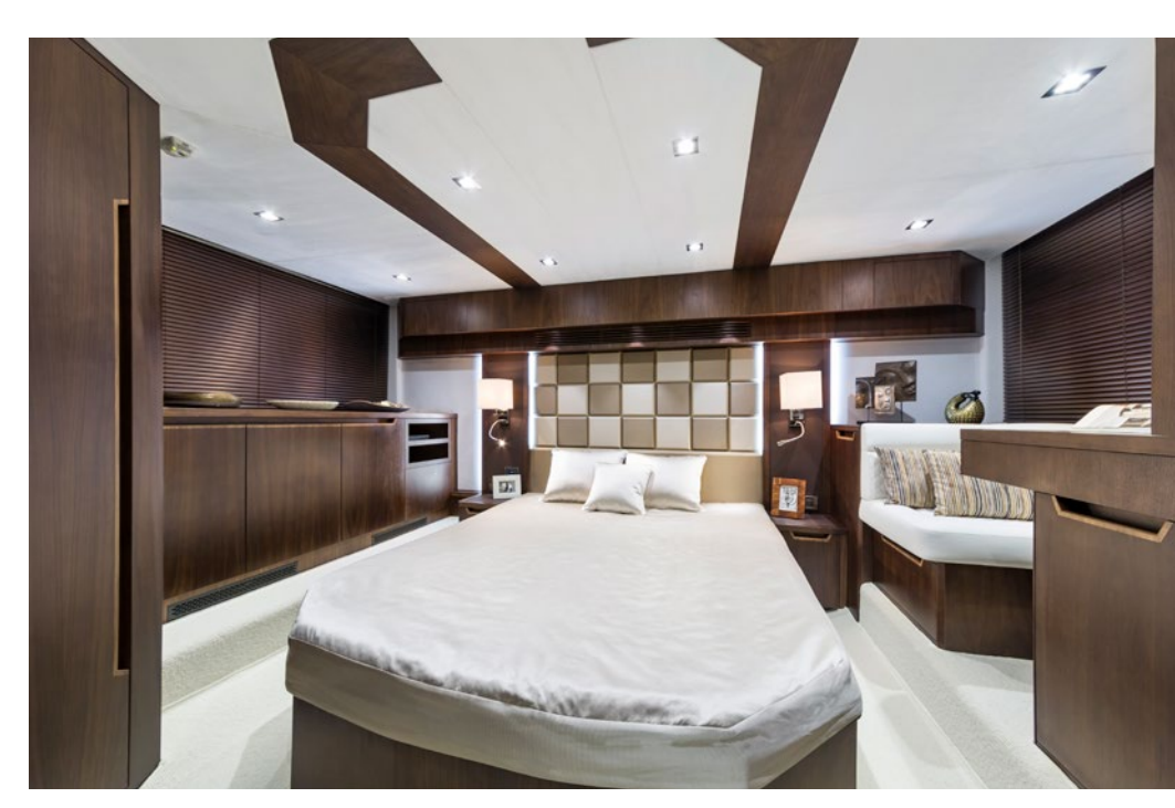
Owner's cabin with standing height all around —