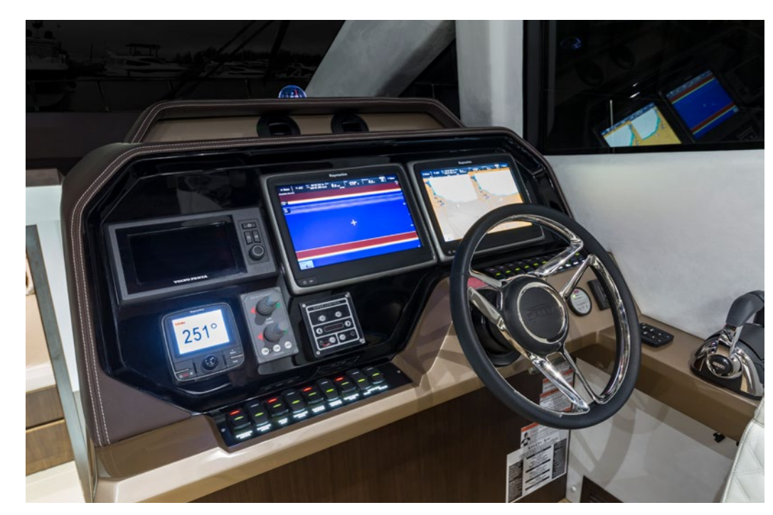
Helm station gives total command of the yacht