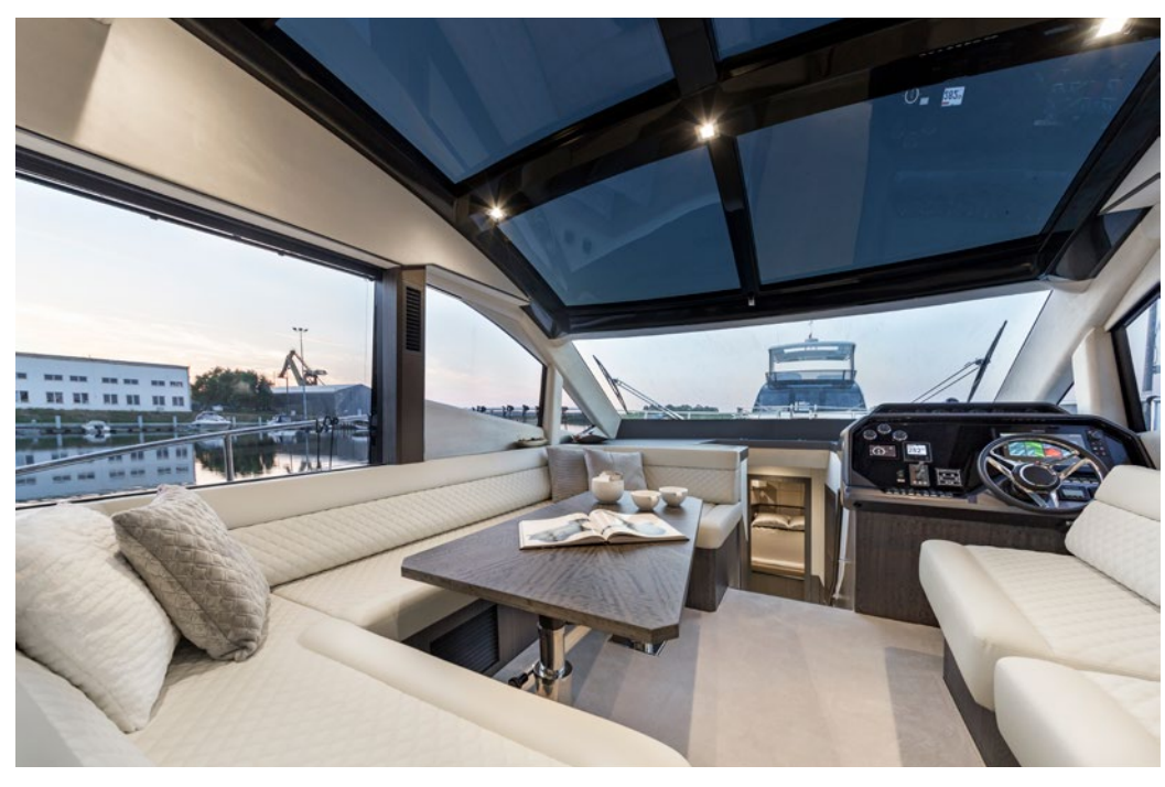
Notice the large sunroof over the entertainment area