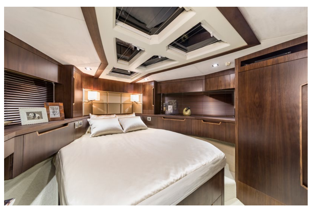
Forward VIP guest cabin with bathroom access