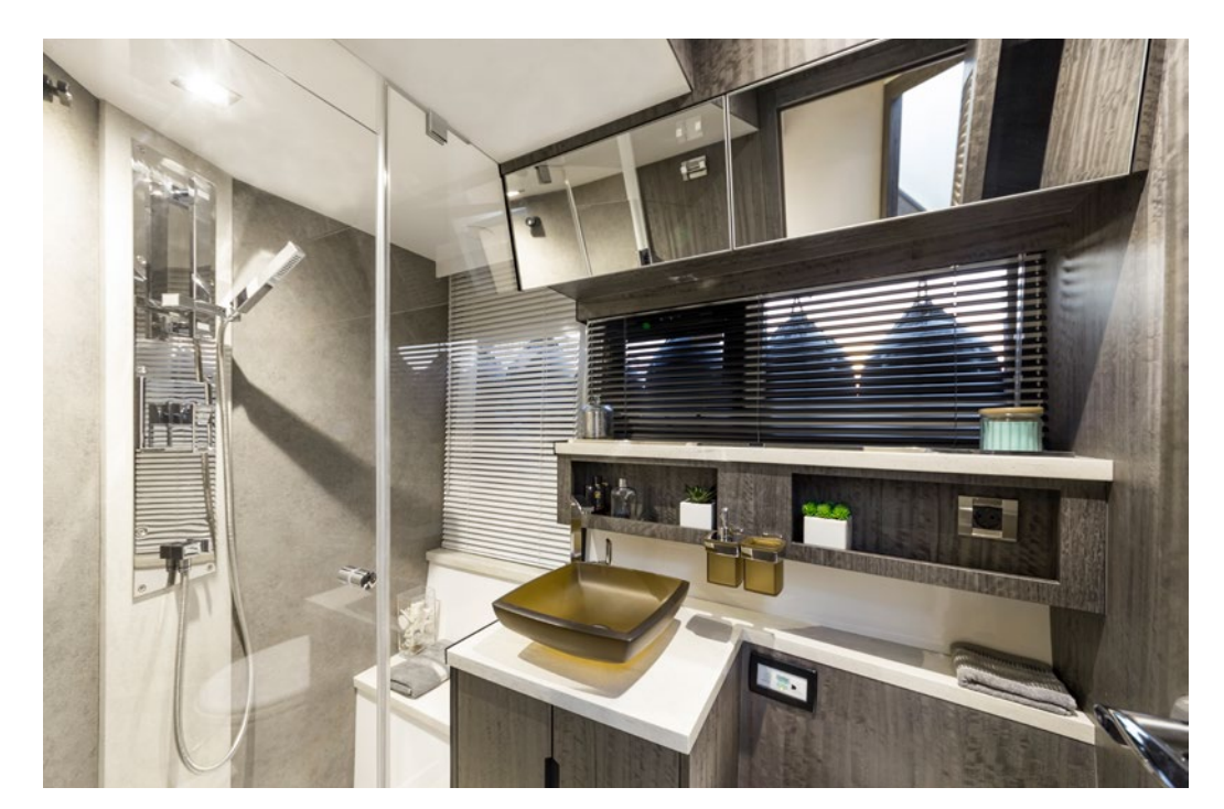
High quality fixtures in both batrooms —