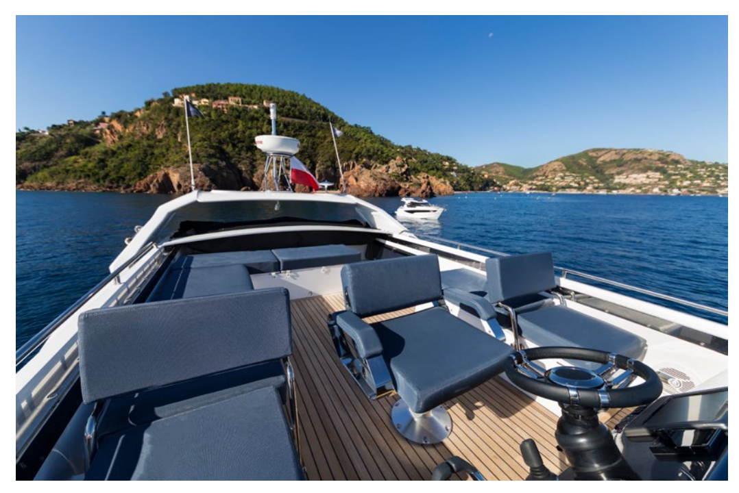
Top deck offers sufficient space and can be closed off completely