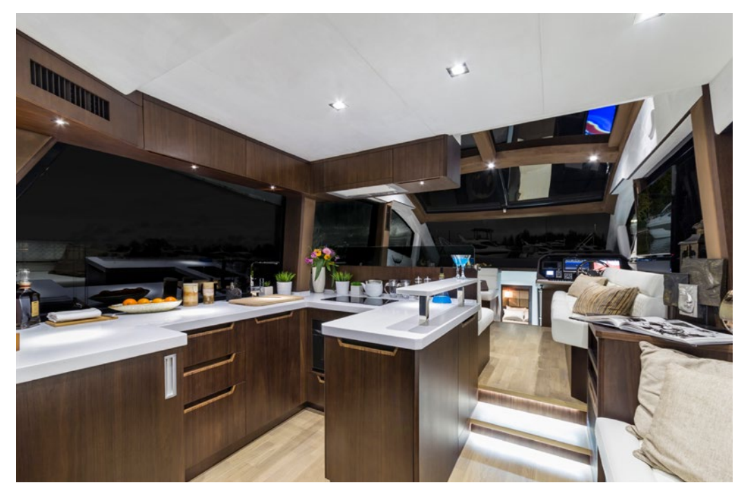
A full-sized galley