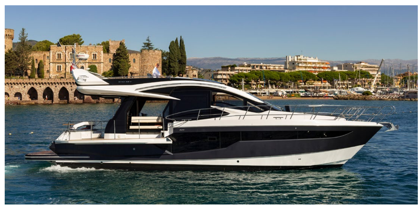
A dynamic line resembling a classic hardtop