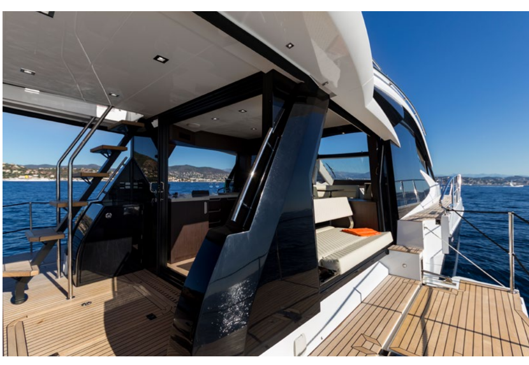
Lots of extra space thanks to Beach Mode