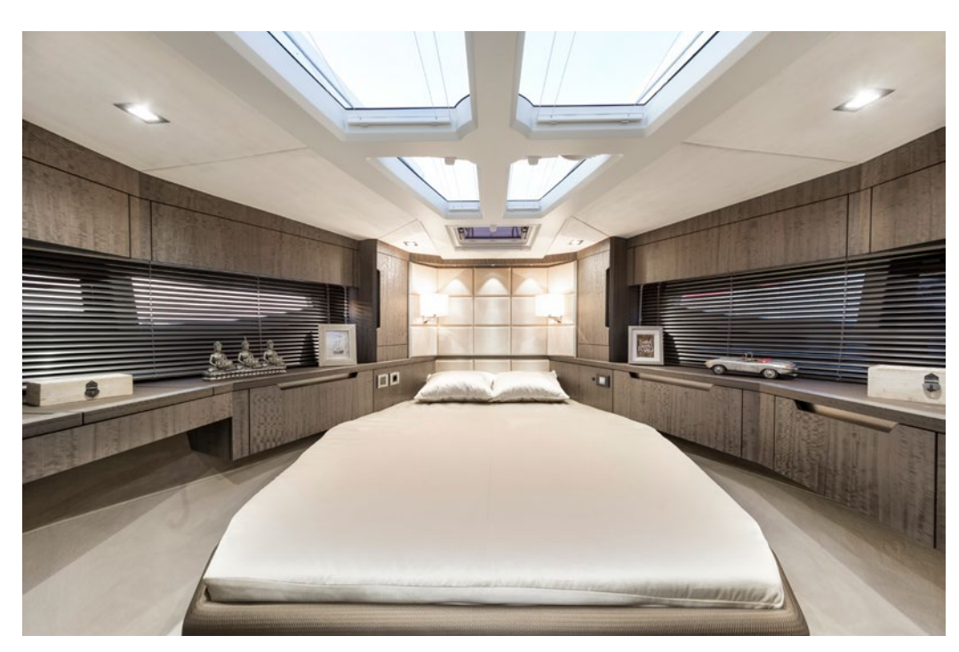
Forward VIP cabin with plenty of storage —