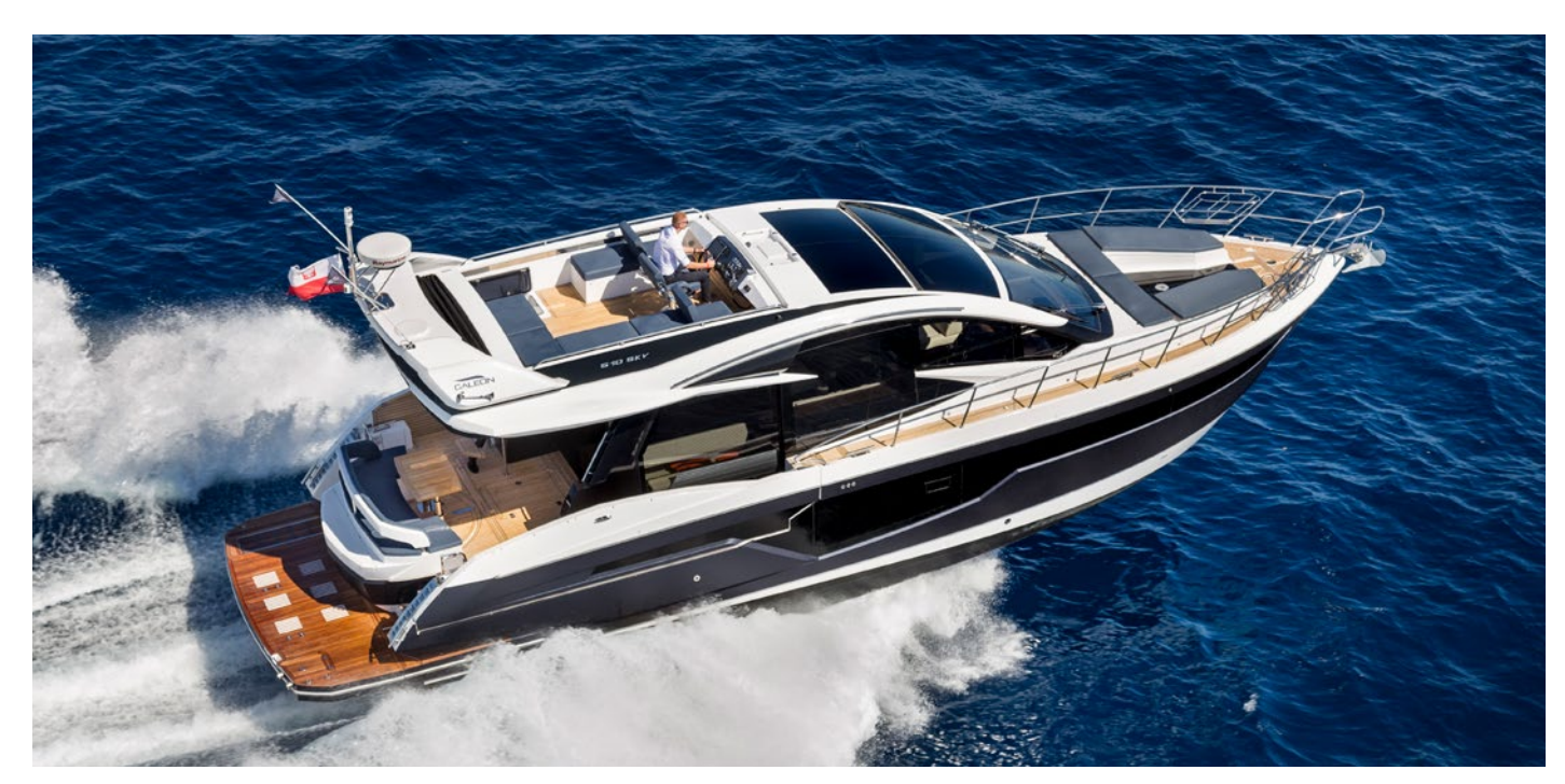
The SKYDECK boasts extravagant design, yet remains surprisingly practical