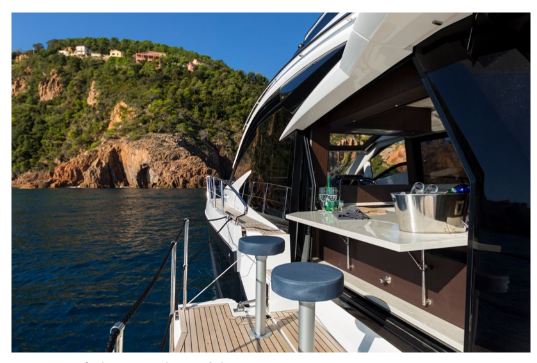
Serve refreshements to the outside bar-amazing!