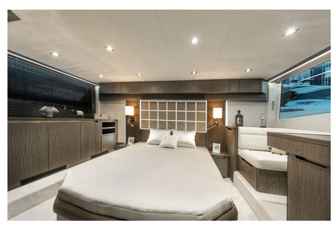
The owner's cabin offers great space and a clever arrangement