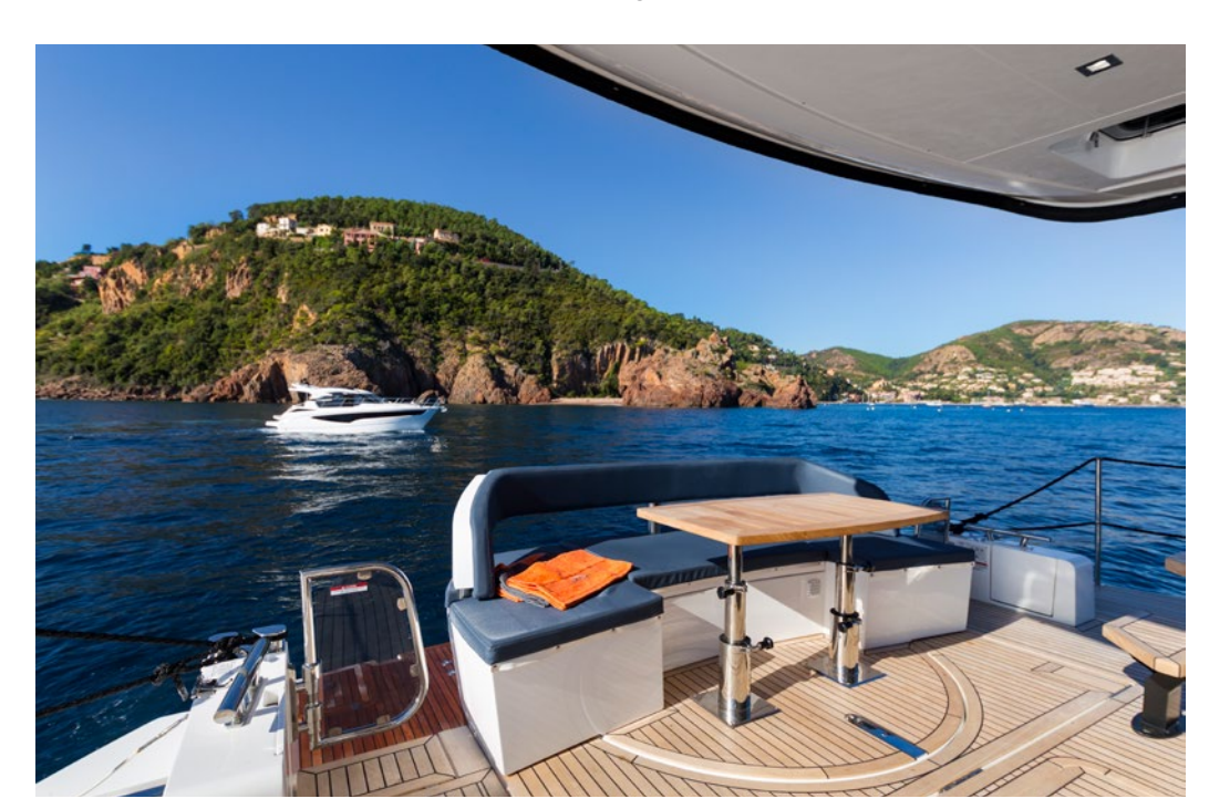
Rotate the aft seat in any direction