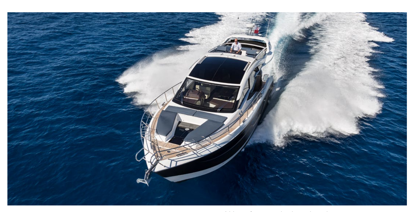
Incredible performance thanks to the Volvo IPS engine option