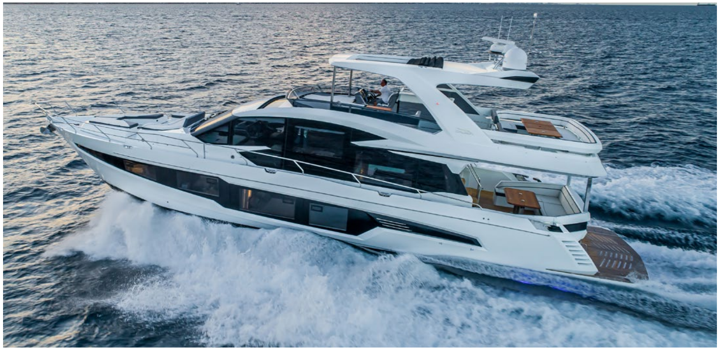
A sleek and dynamic exterior of the 680 —