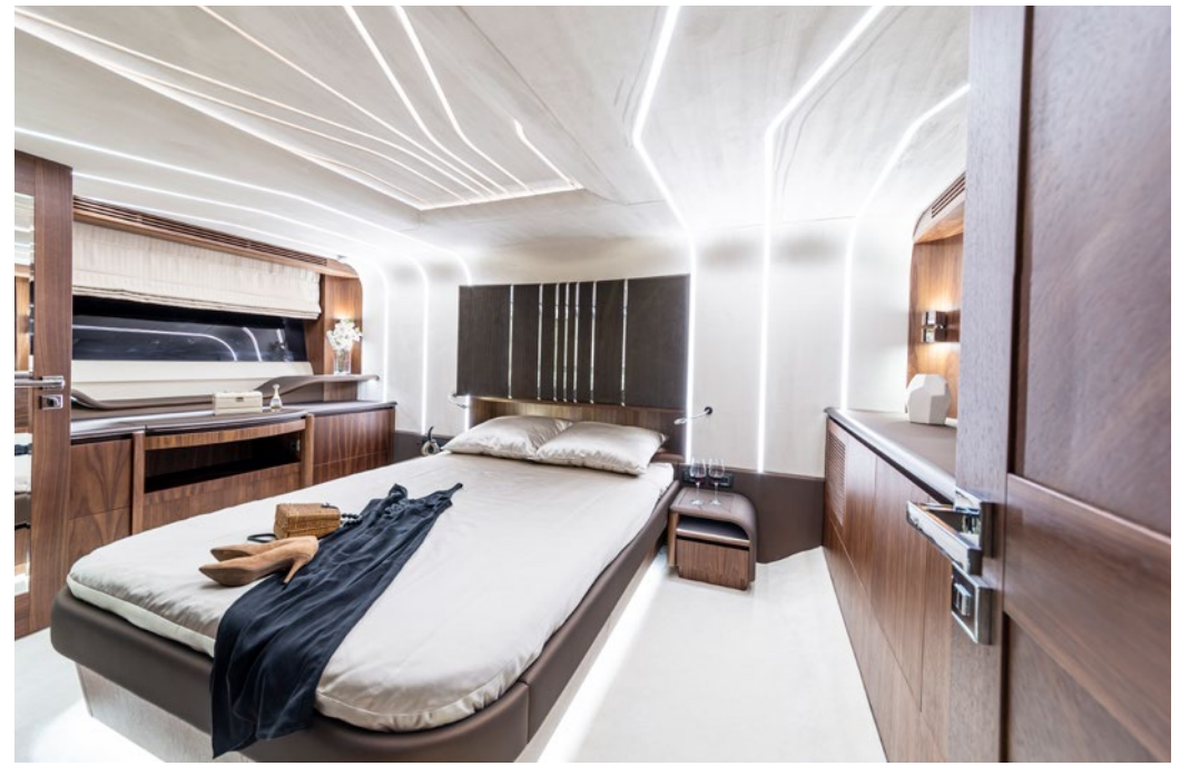
Owner's cabin with private access to the bathroom —