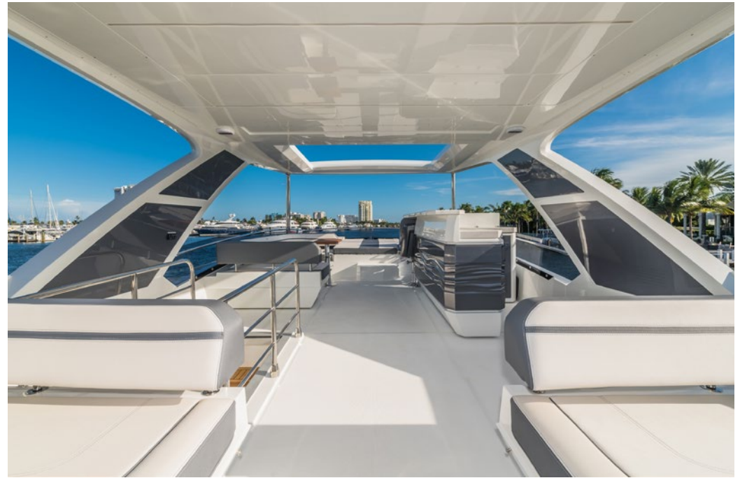
— A vast expanse of flybridge