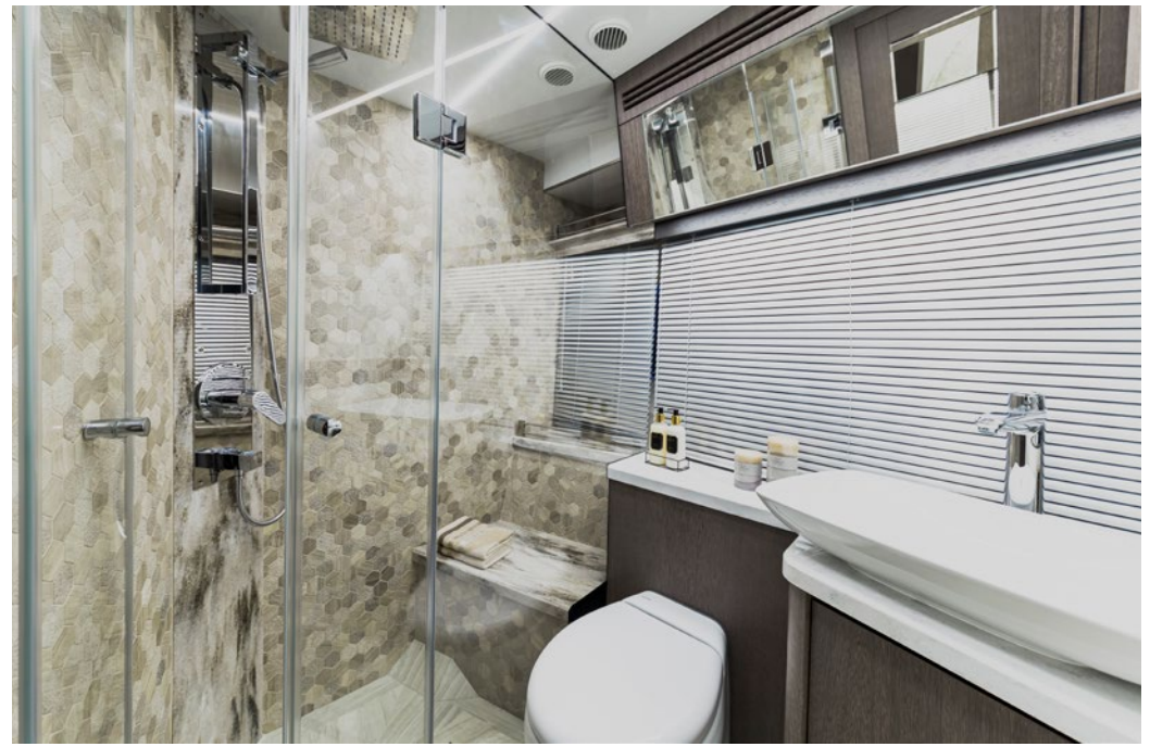
A full-sized, enclosed shower in the bathrooms