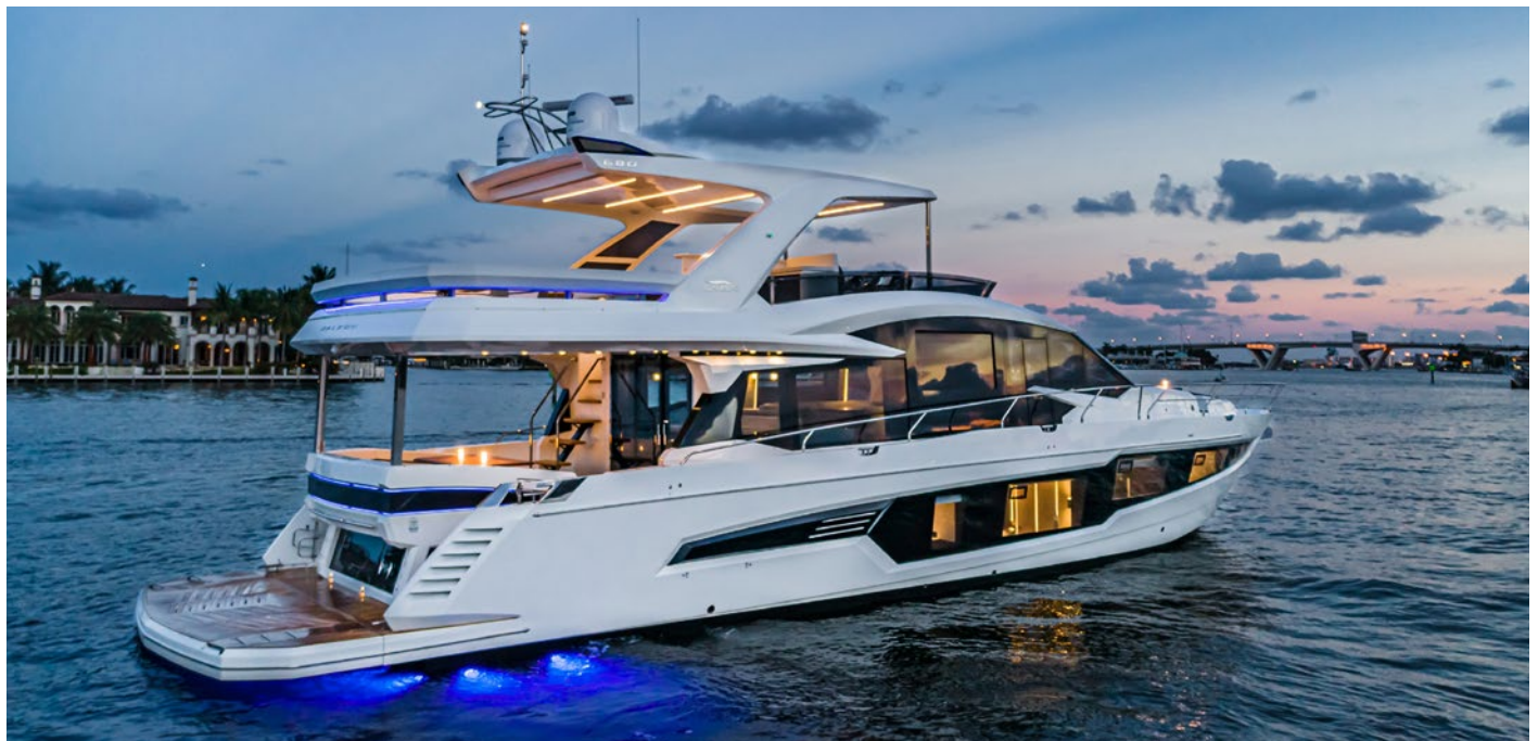
A hydraulic bath platform is available —