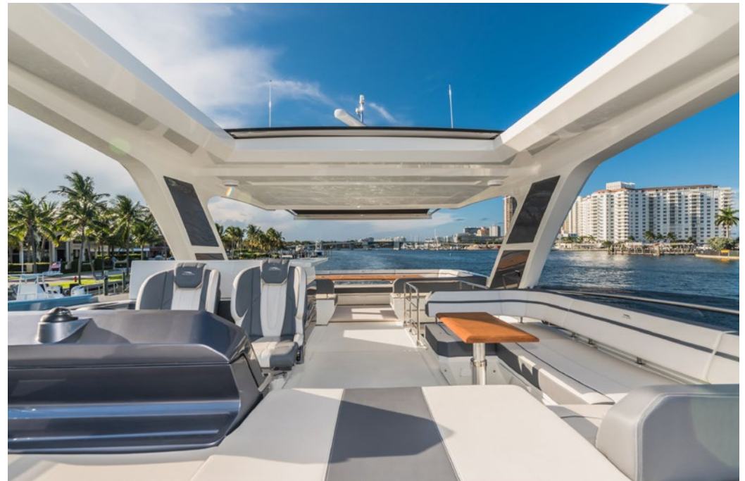
— Great use of space on the flybridge