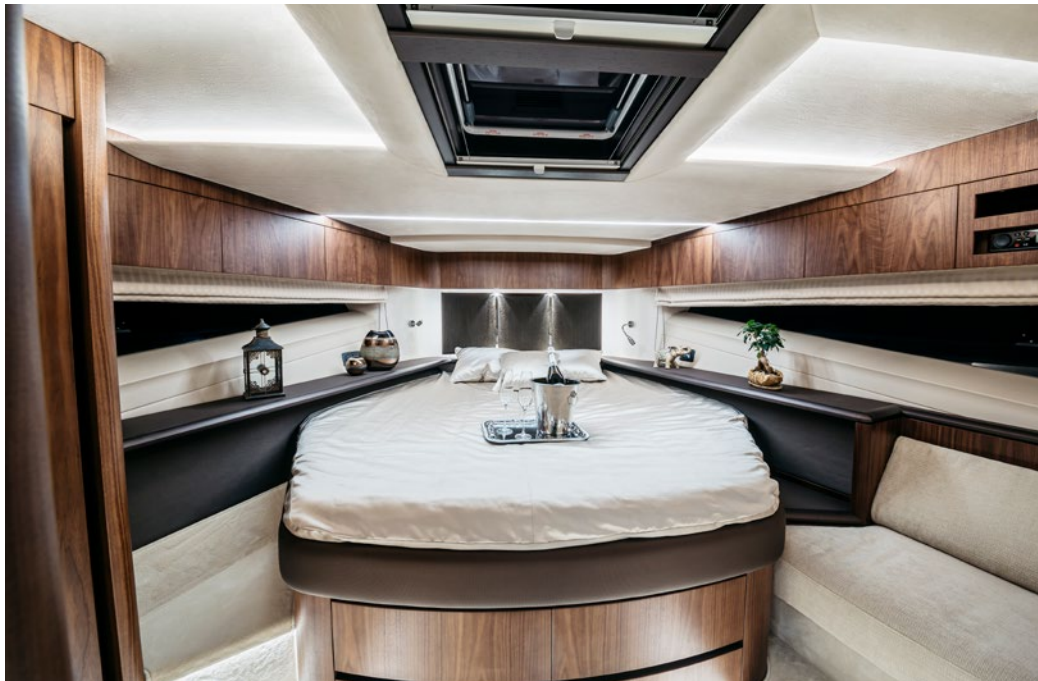
The forward guest cabin is very cosy —