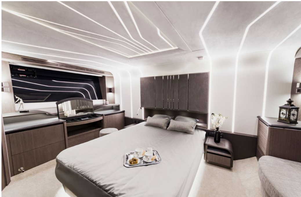
— The owner's cabin offers extraordinary space