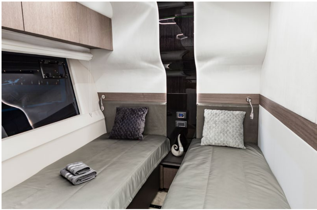
Twin guest cabin