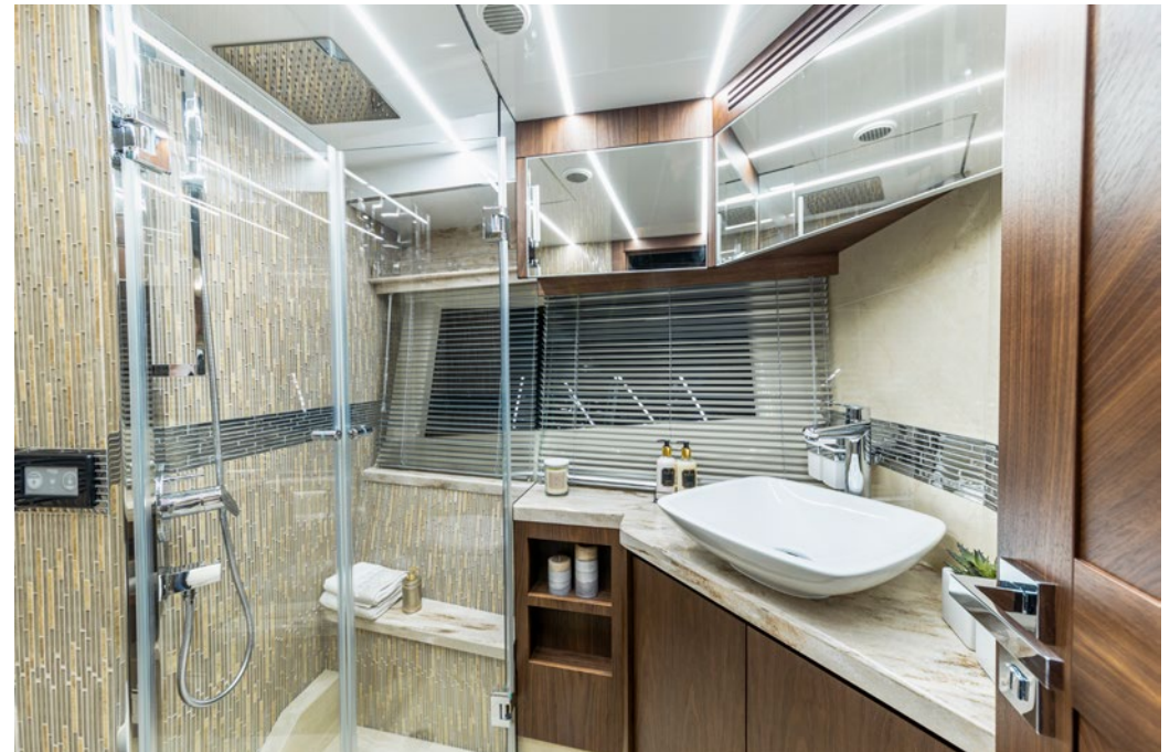
Guest bathroom with head and shower —