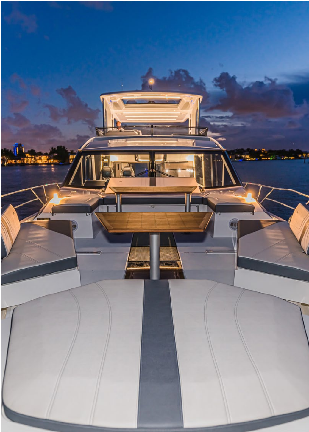
— Find respite in the sunroof