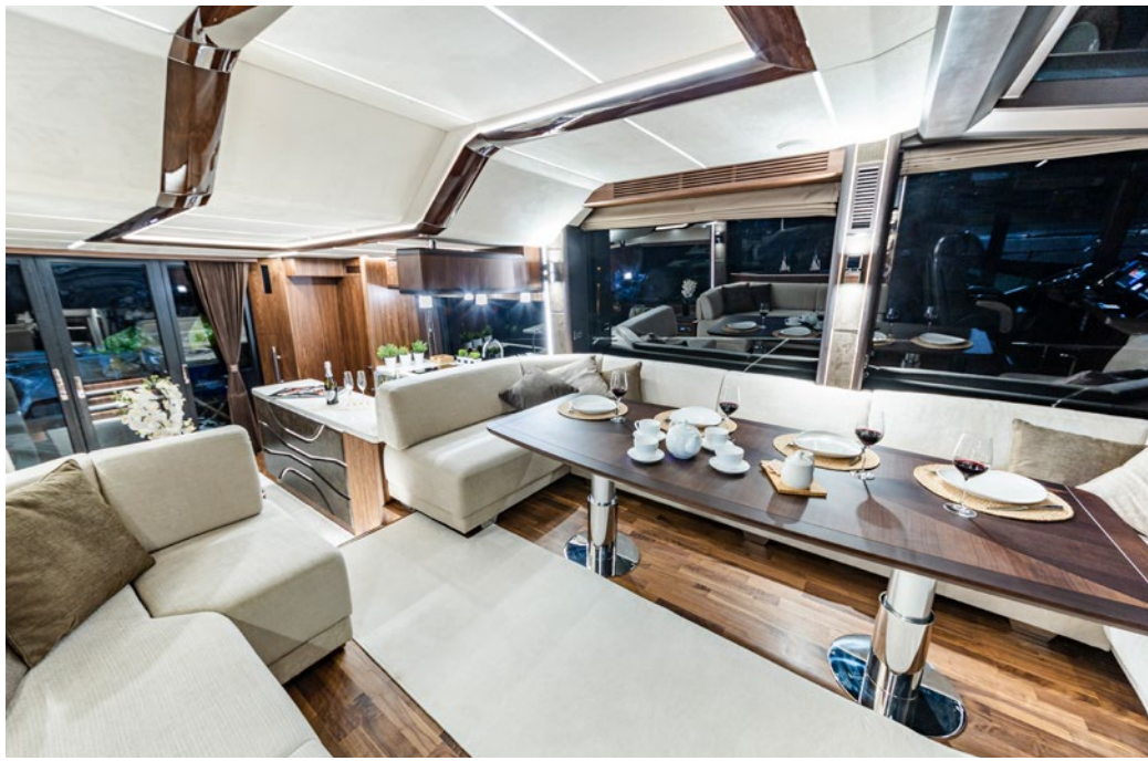
A spacious interior is modern and bright —