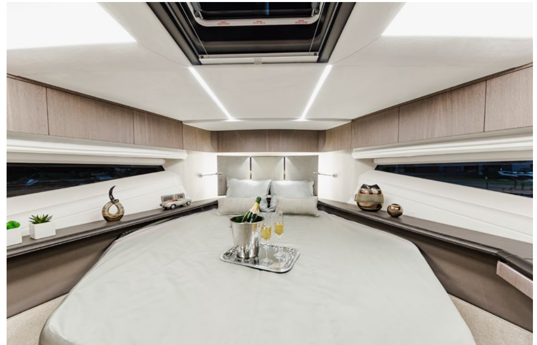
— Forward owner's cabin