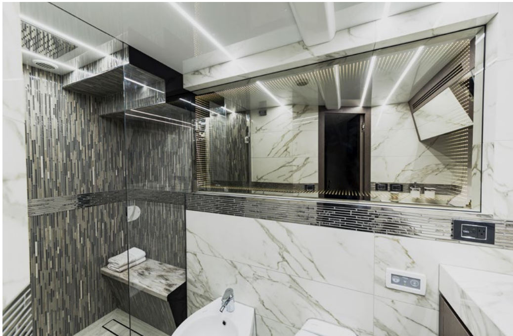
Incredible infinity mirror in the owner's bathroom