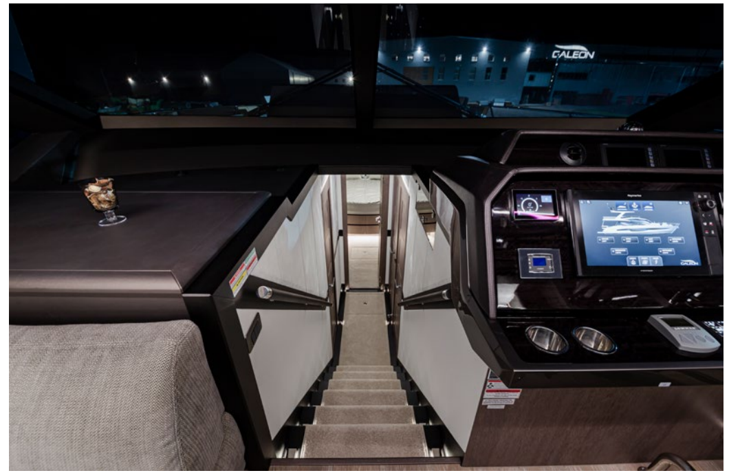
— Two separate stairways leading down below to four guest cabins