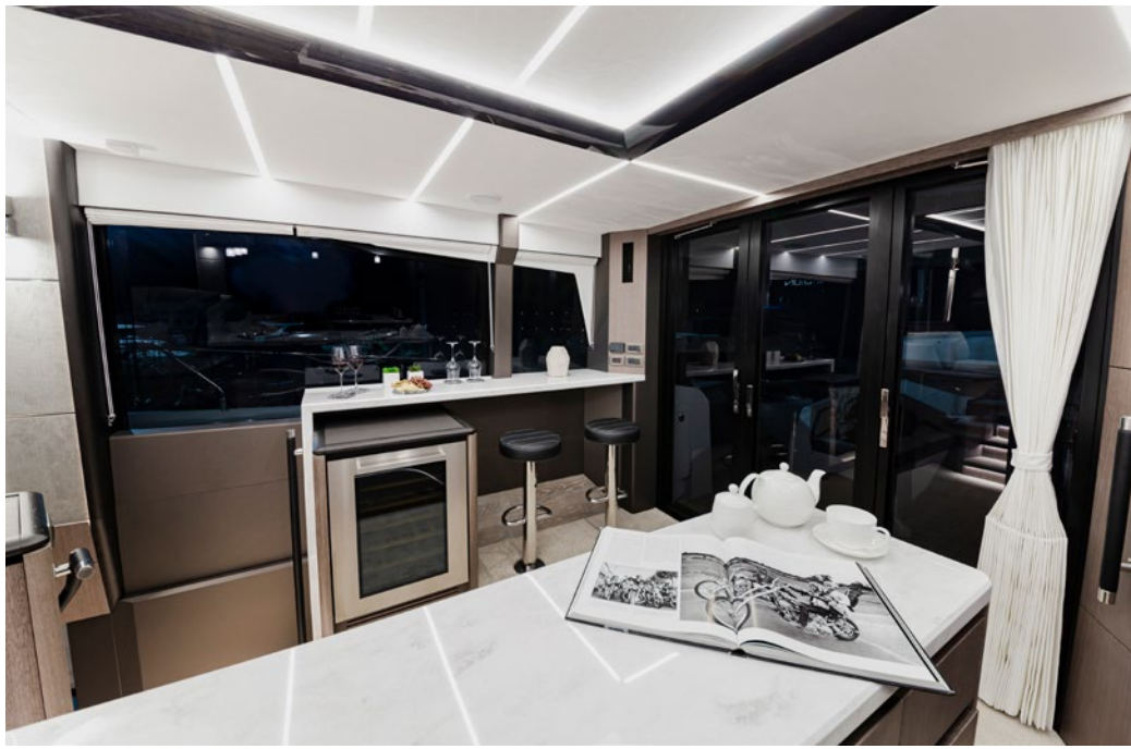
— Functional bar area