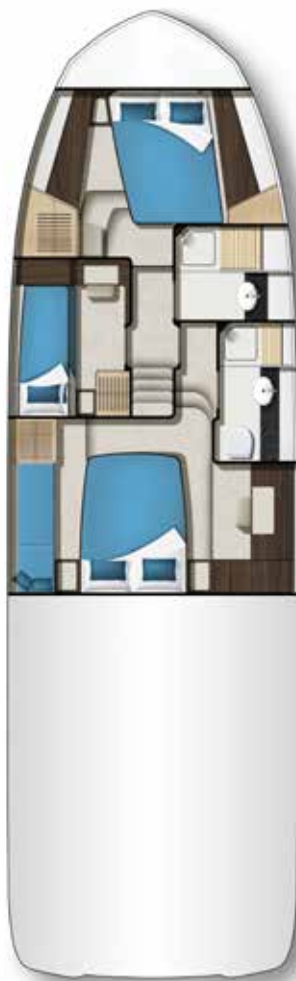
3 CABIN STANDARD