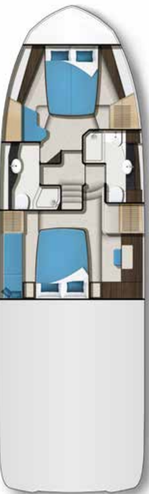
2 CABIN OPTION