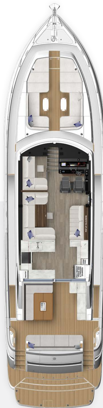
SALOON DECK Dining table deployed