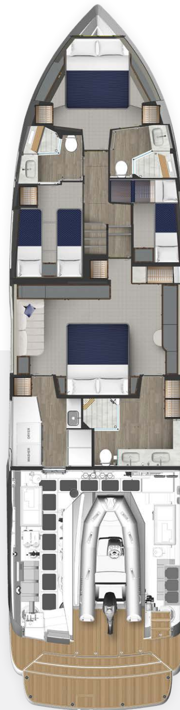
ACCOMMODATION DECK Shown with utility room