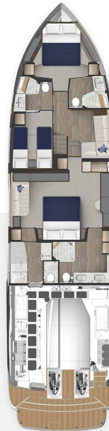
ACCOMMODATION DECK Shown with optional lower lounge and crew cabin